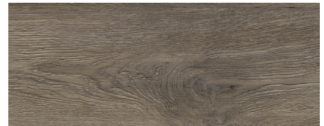
Coarse Pewter HC1060