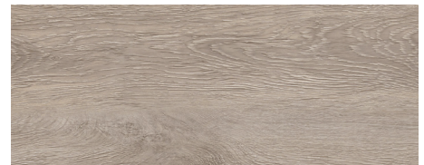
Cool Greige HC1030