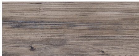
Early Dusk HC1040