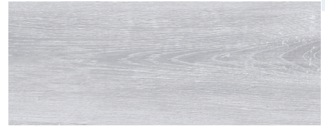
Clear Pearl HC1100