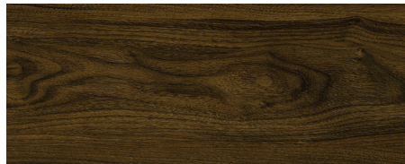
Deep Coco HC1020