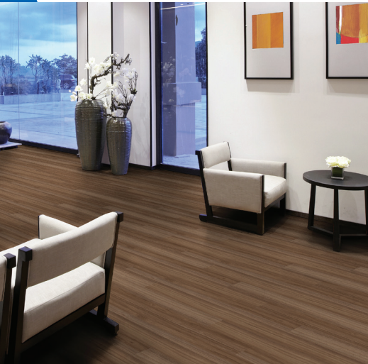
NovaClic FD® Floating Installation System