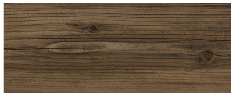
Roasted Peanut HC1050