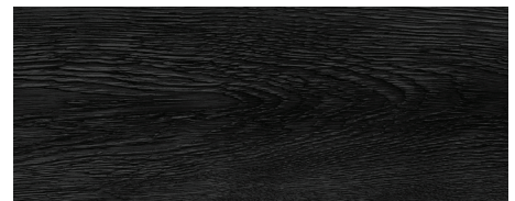
After Midnight HC1000