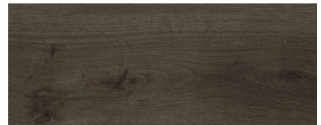
Steel Taupe HC1090