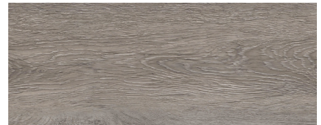
Iced Silver HC1010