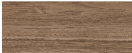
Caramel Syrup HC1110