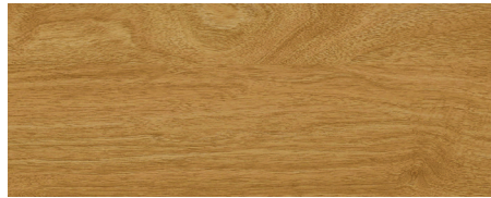
Honey Sand HC1080

HushCore's high performance construction and protective Cobalt Guard finish provides superior resistances to scratching, scuffing, and indentations while helping hide minor substrate irregularities. With a LIFETIME residential warranty and a 10-year commercial warranty, HushCore is the perfect solution for your flooring needs.