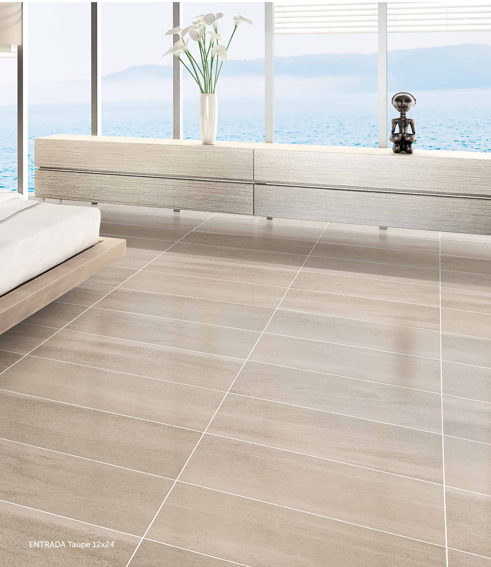
ENTRADA Taupe 12x24