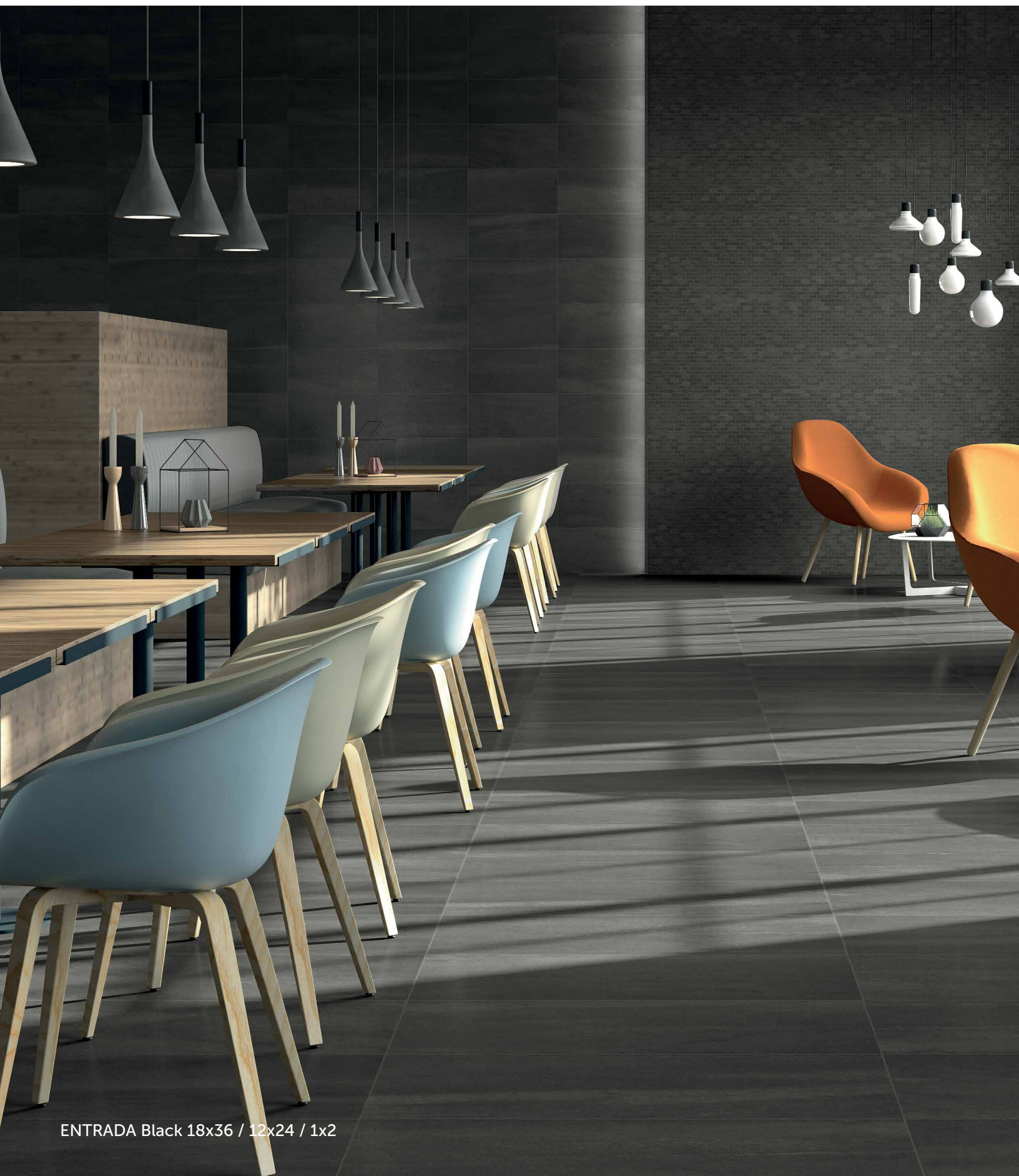
ENTRADA Black 18x36 / 12x24 / 1x2