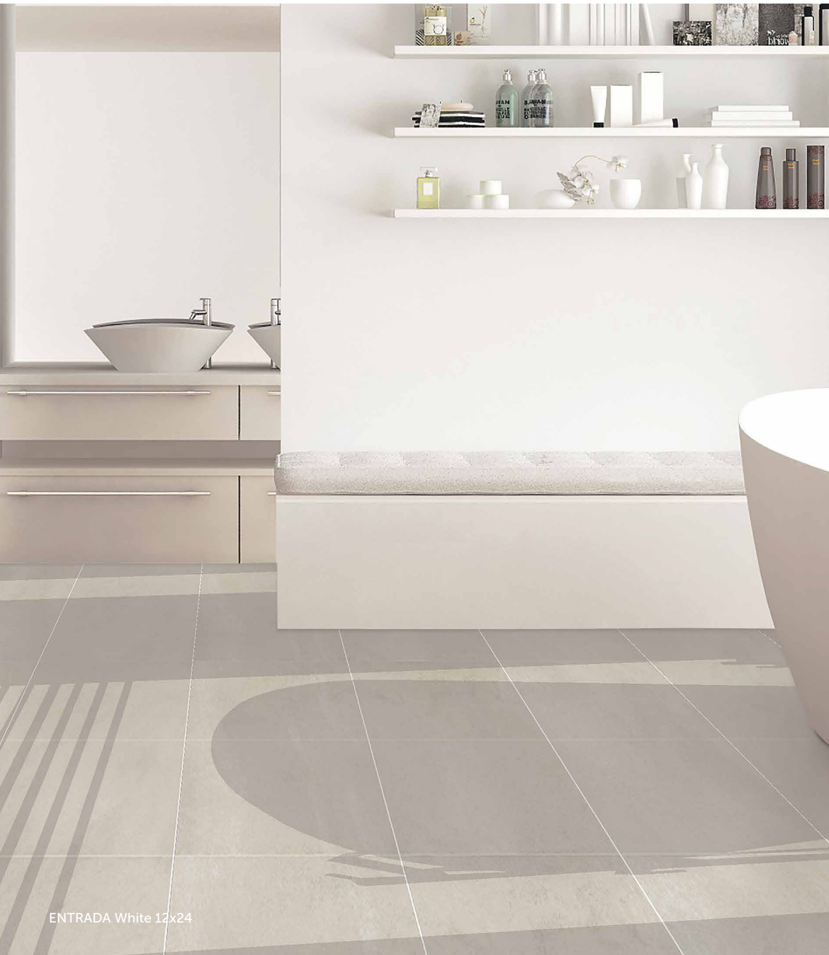
ENTRADA White 12x24