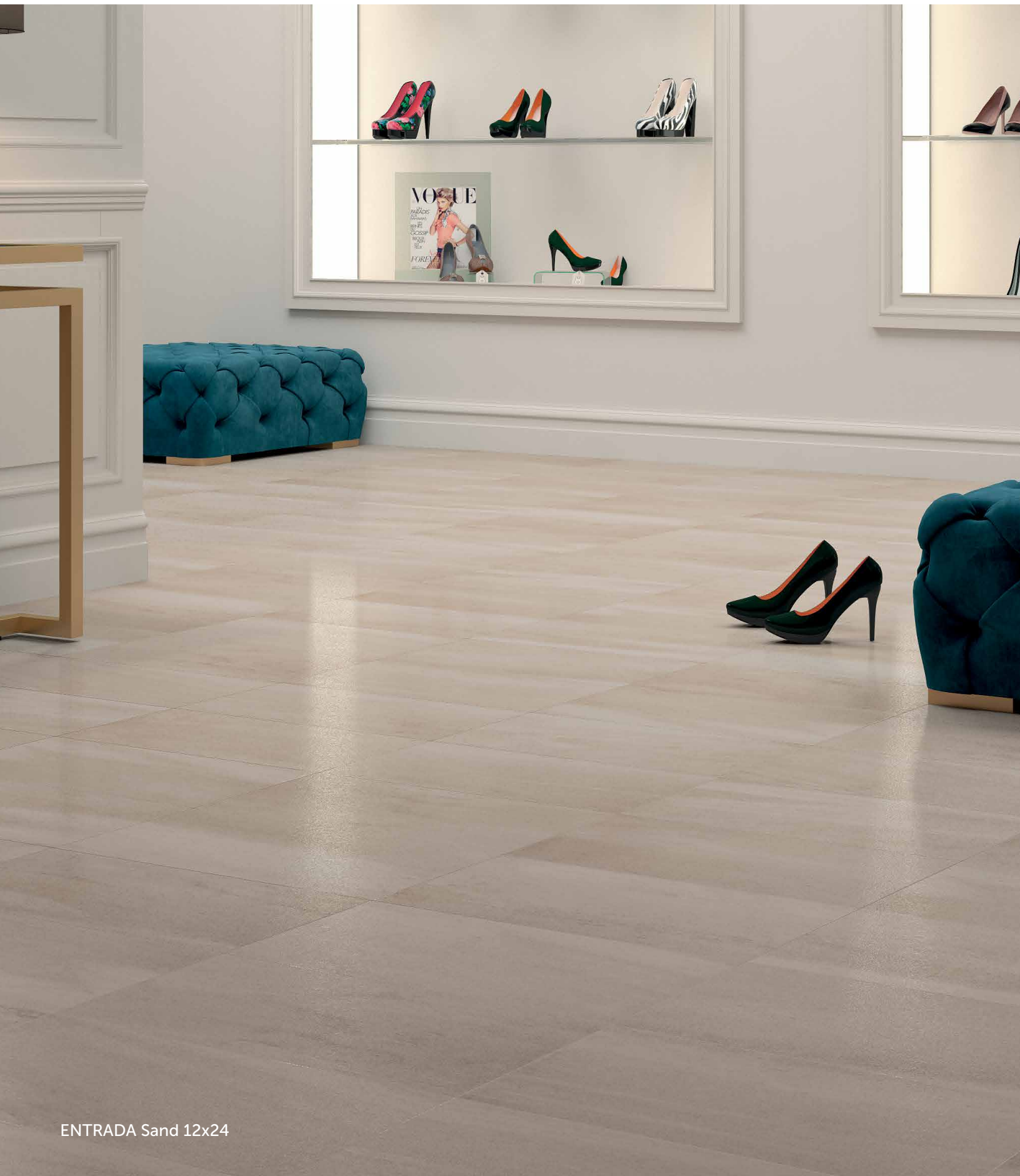
ENTRADA Sand 12x24