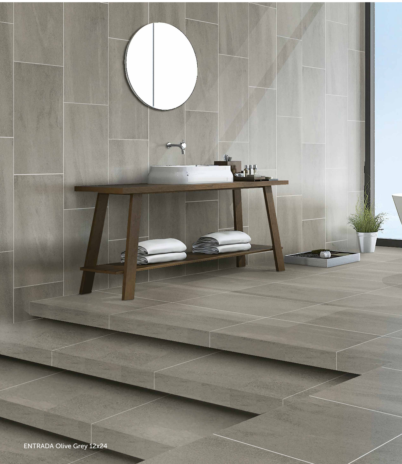
ENTRADA Olive Grey 12x24