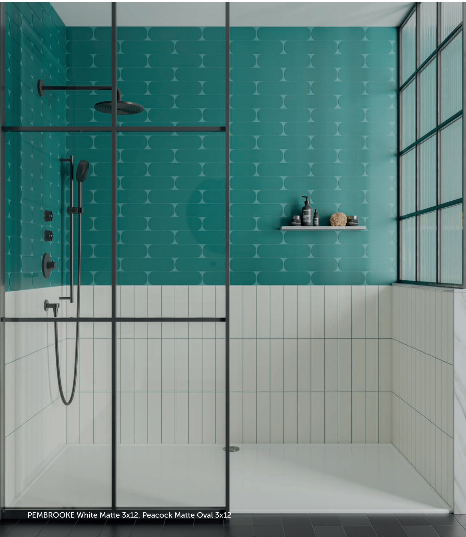
PEMBROOKE White Matte 3x12, Peacock Matte Oval 3x12