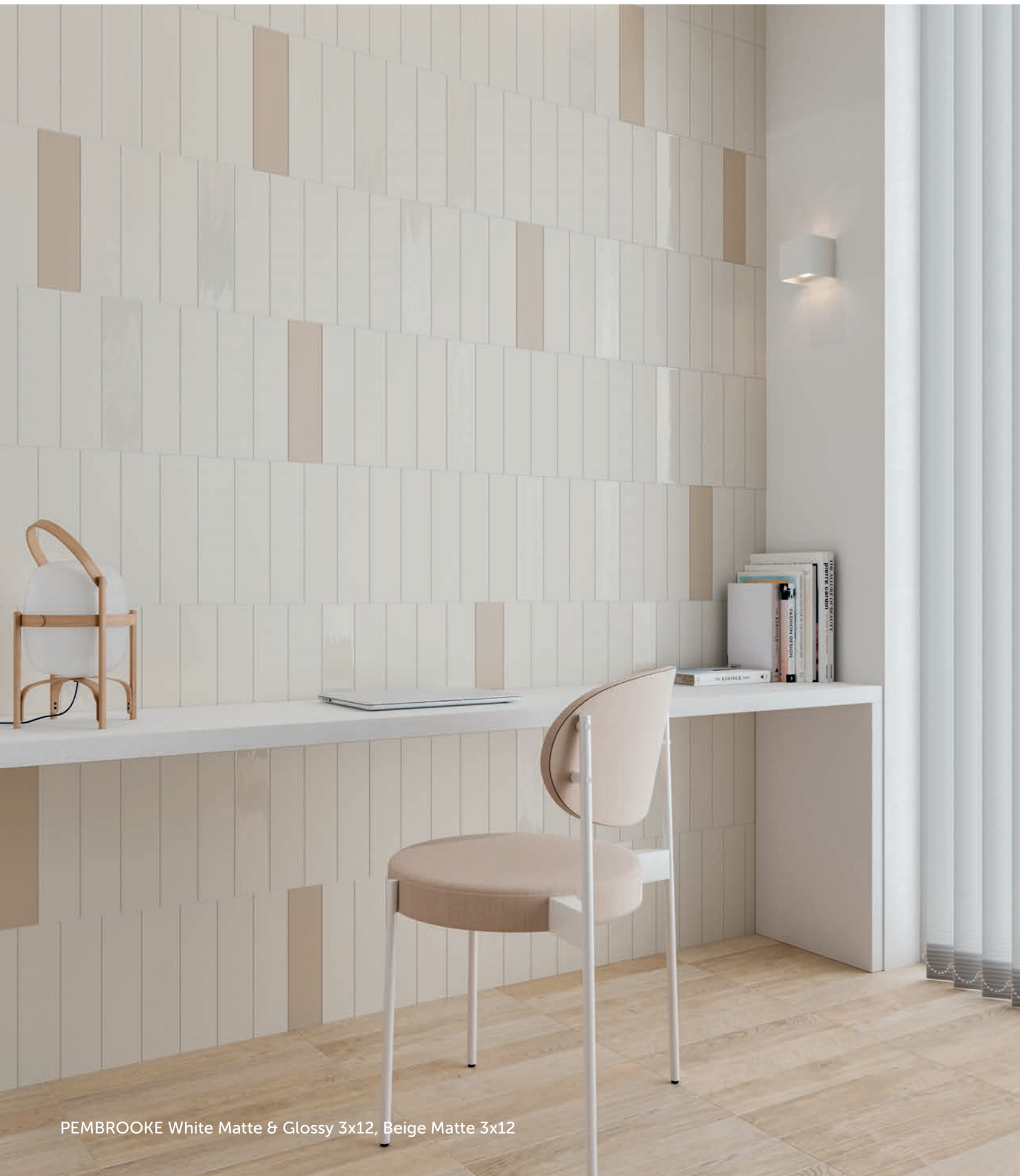
PEMBROOKE White Matte & Glossy 3x12, Beige Matte 3x12