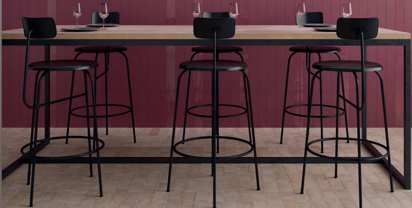
PEMBROOKE Rouge Matte & Glossy 3x12