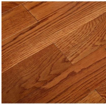
Figure 1: Installed engineered hardwood flooring