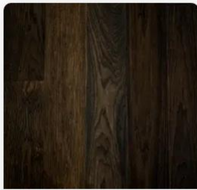
Woodwright ✓ Pecan/Hickory 59000 (1)