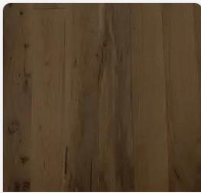
Woodwright ✓ Texas Post Oak 67000 (1)