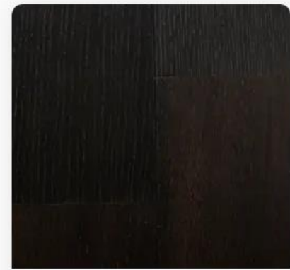
Woodwright ✓ White Oak 70000 (1)