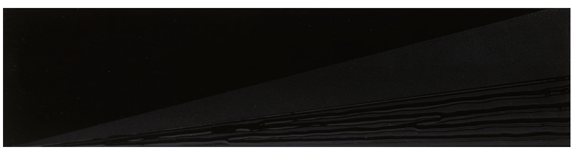
SNP04 ▶ Coal Left