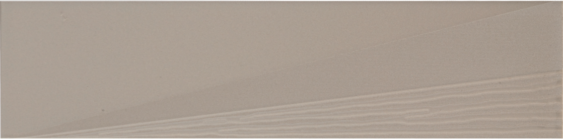
SNP12 ▶ Warm Silver Left