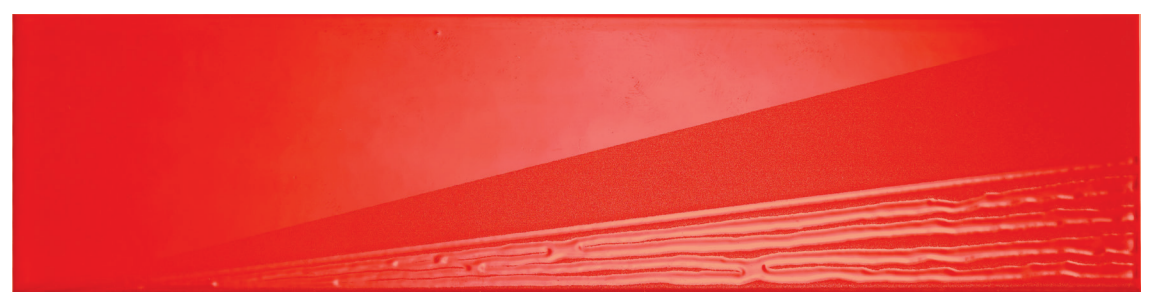
SNP23 ▶ Lipstick Left