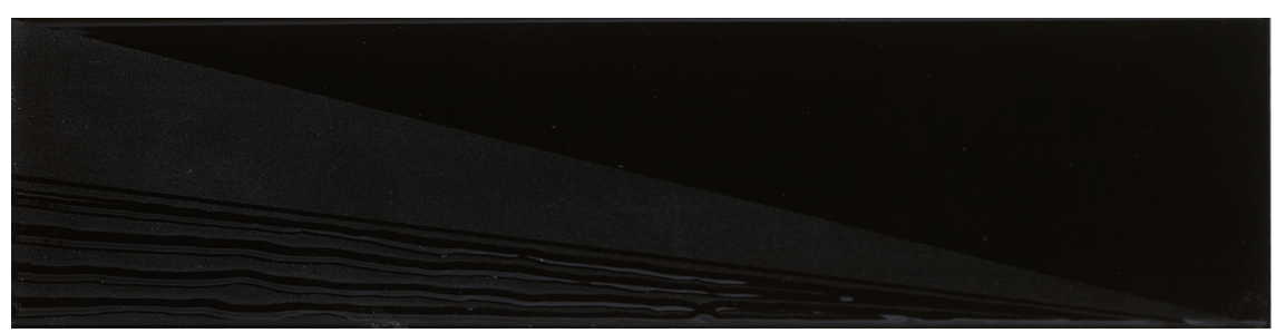
SNP04 ▶ Coal Right