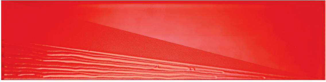
SNP23 ▶ Lipstick Right