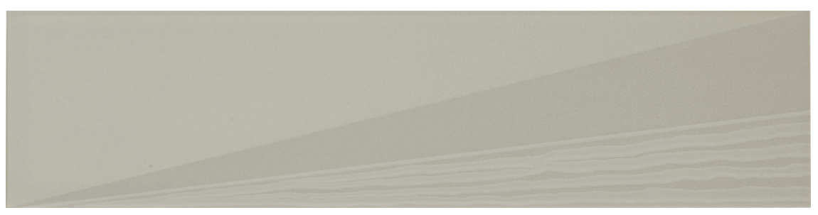
SNP03 ▶ Stone Left