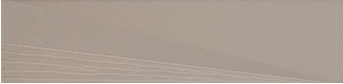
SNP12 ▶ Warm Silver Right