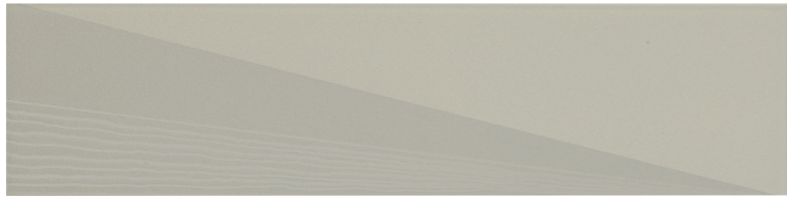
SNP03 ▶ Stone Right