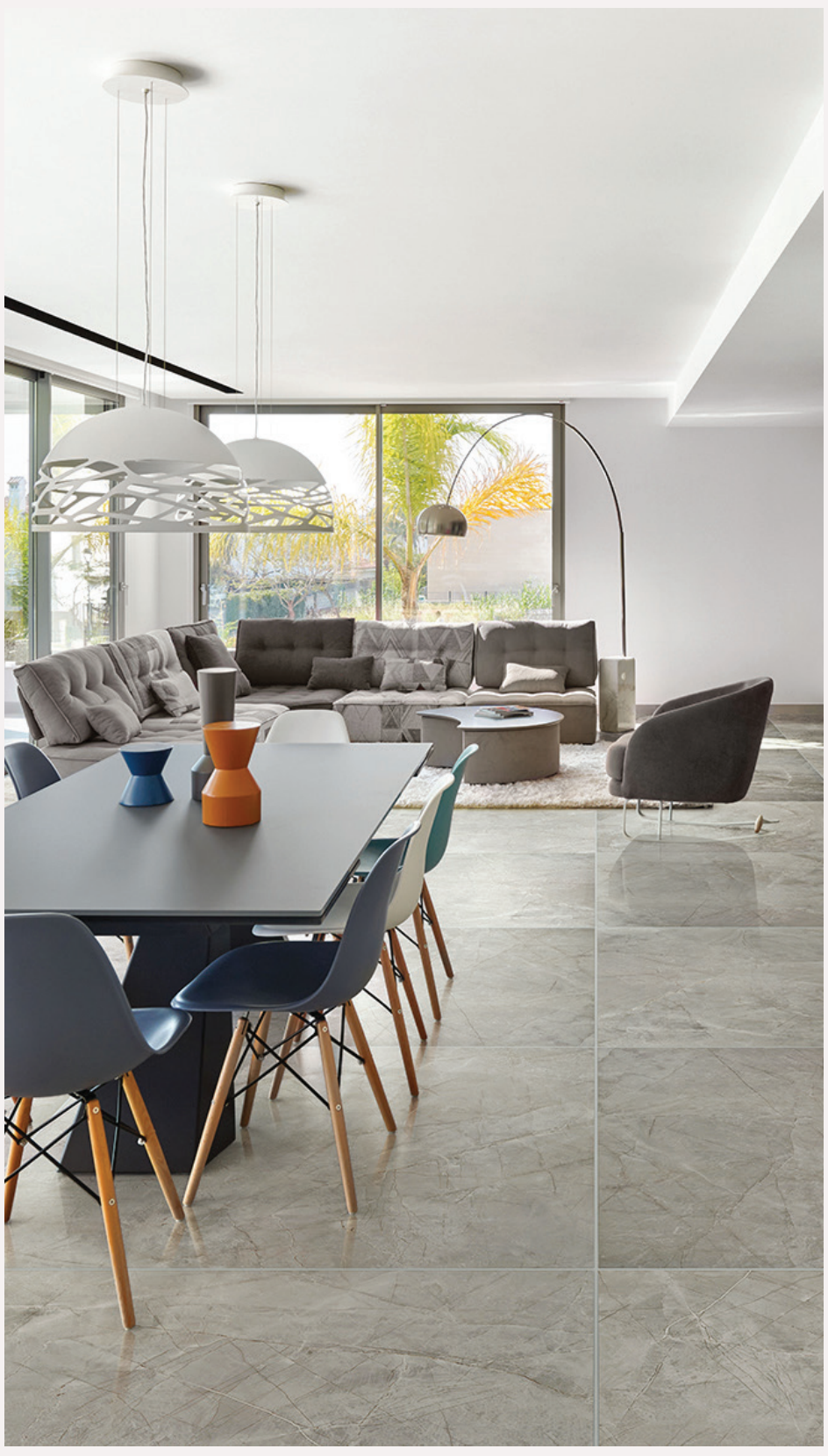
SALO4 ▶ Mare D'Autunno 48 x 48 PO