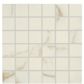
SAL02.10202MOS > Oro Bianco 2 x 2 Mosaic