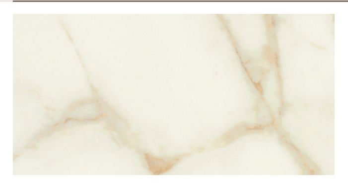
SAL02 ▶ Oro Bianco