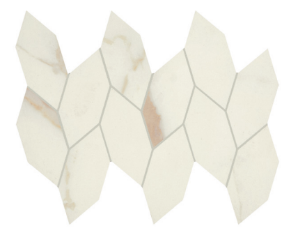
SAL02.1LEAFMOS > Oro Bianco Leaf Mosaic