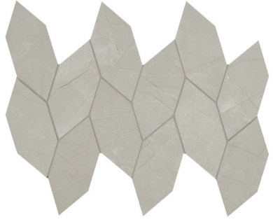
SAL04.1LEAFMOS > Mare D'Autunno Leaf Mosaic