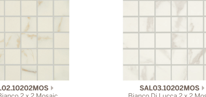
Bianco Di Lucca 2 x 2 Mosaic