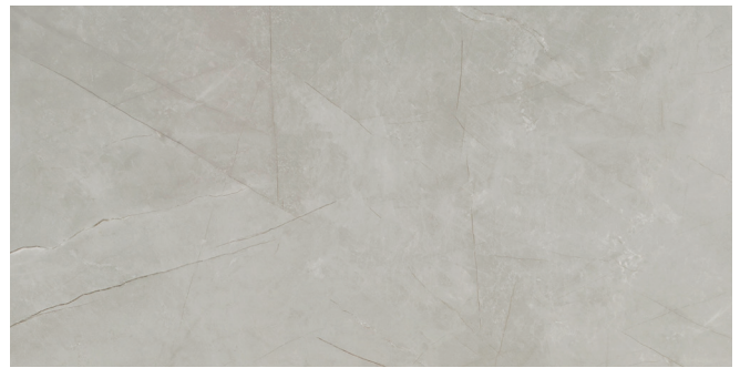
SALO4 ▶ Mare D'Autunno