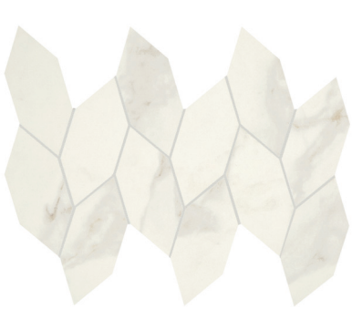
SAL03.1LEAFMOS > Bianco Di Lucca Leaf Mosaic