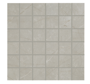
SAL04.10202MOS > Mare D'Autunno 2 x 2 Mosaic