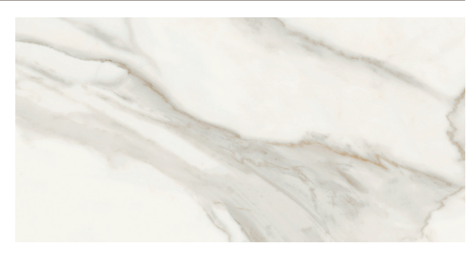
SAL03 ▶ Bianco Di Lucca