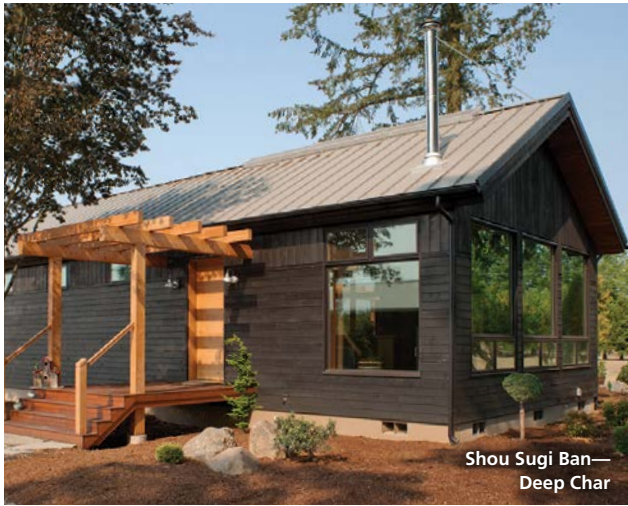
Shou Sugi Ban— Deep Char