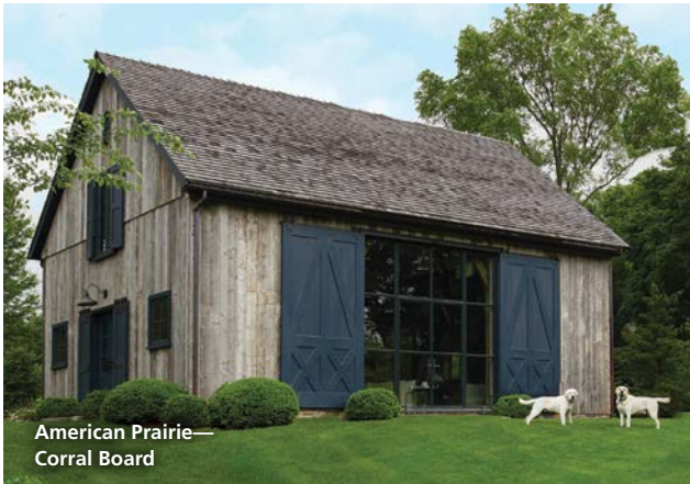
American Prairie— Corral Board