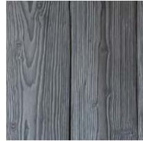
Color Char Grey