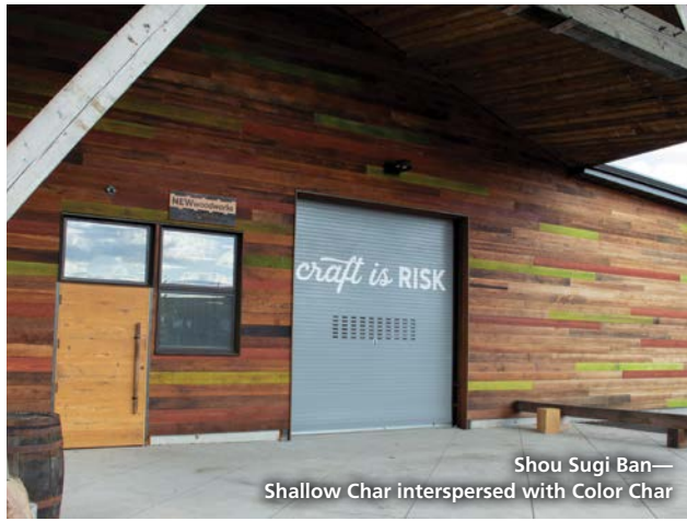
Shou Sugi Ban— Shallow Char interspersed with Color Char