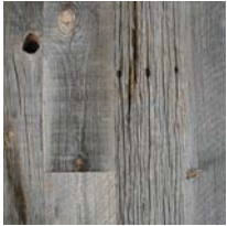
Weathered Grey Original patina

Corral Board Trim: 6", 8", or 10" nominal widths. Random lengths up to 16'.