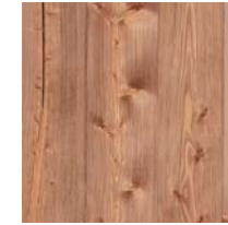
Standard—Bronze Cedar Wire Brushed