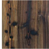
Color Char Tiger's Eye