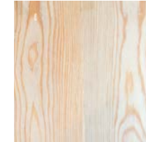
Standard—Unfinished Wire Brushed