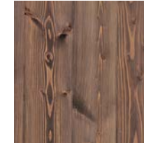
Standard—Mahogany Wire Brushed