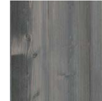
Standard—Battleship Grey Wire Brushed