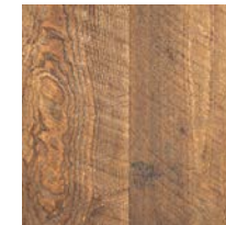
Select—Light Brown Circle Sawn or Wire Brushed