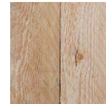
Select—Unfinished Circle Sawn or Wire Brushed