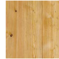
Standard—Natural Wire Brushed

Select Boards: 2", 4", 6", 8" or 10" nominal widths, lengths up to 16'.