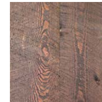
Select—Mahogany Circle Sawn or Wire Brushed