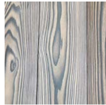
Color Char White