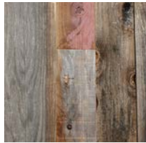
Redwood Original patina