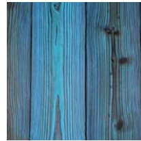
Color Char Lagoon