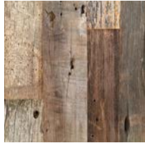
Taphouse Original patina