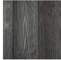
Color Char Charcoal