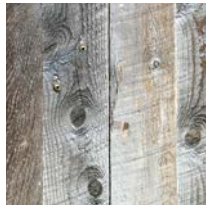
Corral Board Trim Original patina