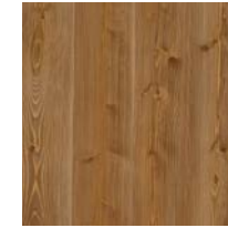
Standard—Light Brown Wire Brushed