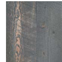
Select—Battleship Grey Circle Sawn or Wire Brushed