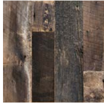
Brown Board Original patina