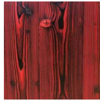
Color Char Poppy