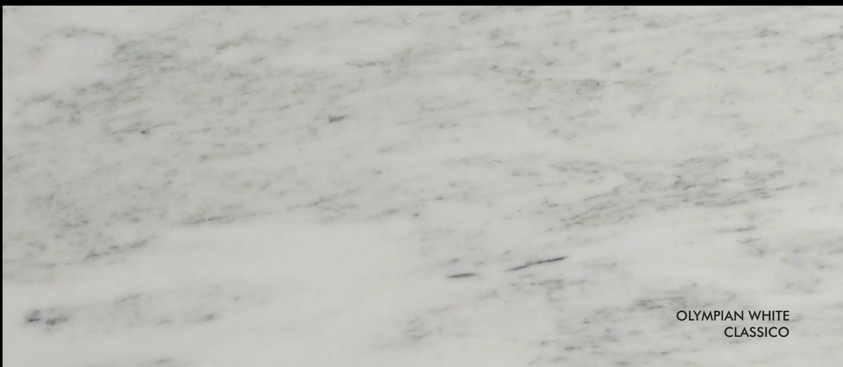
OLYMPIAN WHITE CLASSICO