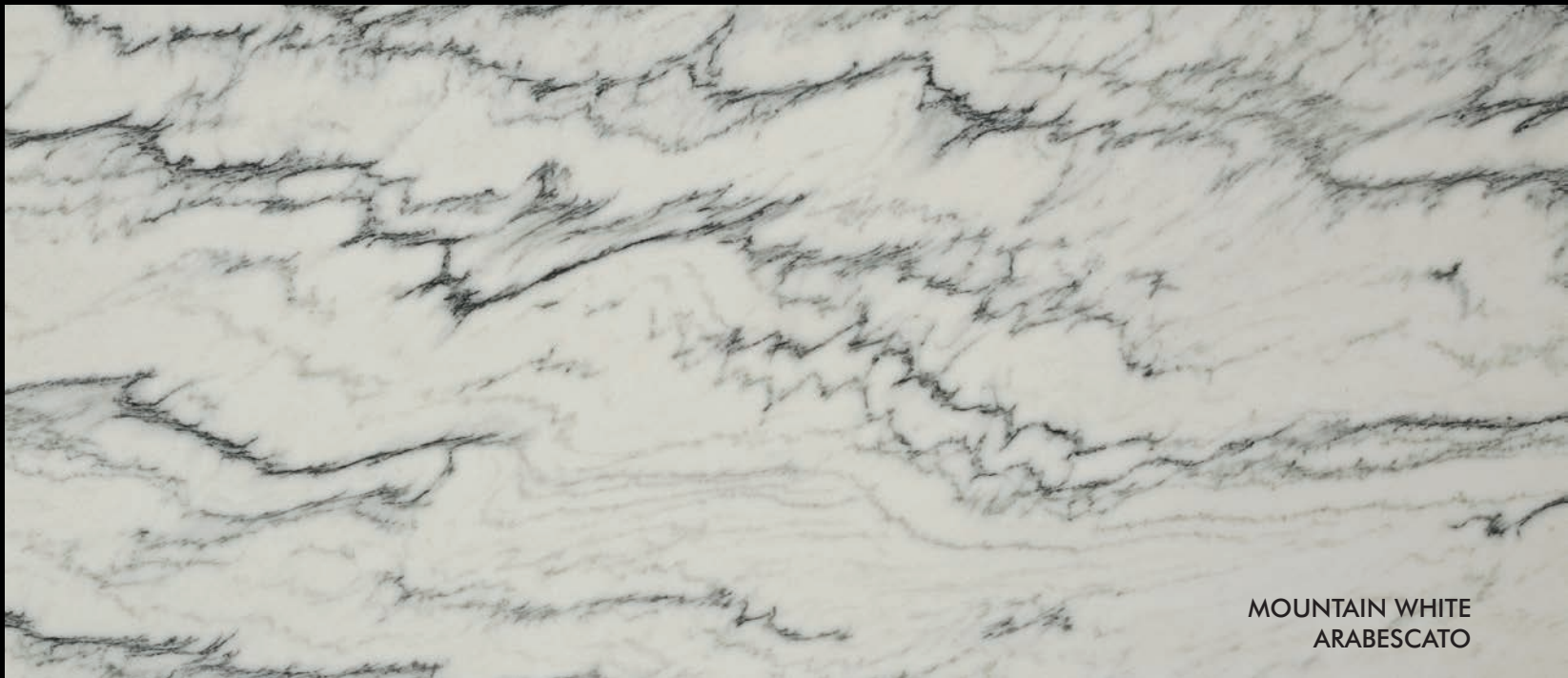
MOUNTAIN WHITE ARABESCATO