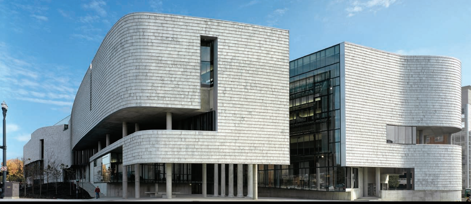
OLYMPIAN WHITE SELECT