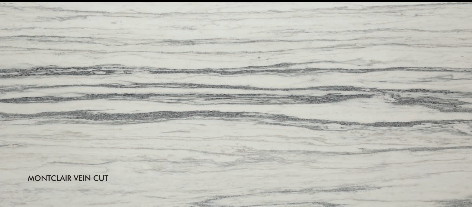
MONTCLAIR VEIN CUT