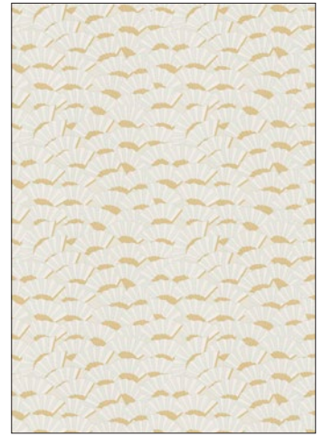
SOGI 7 COLORWAYS (CL WP36408)