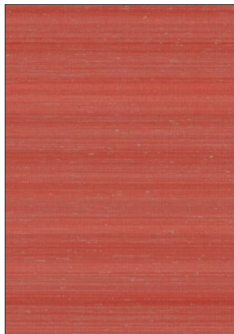
MELOGRANO UNITO 9 COLORWAYS (CL WP88332)