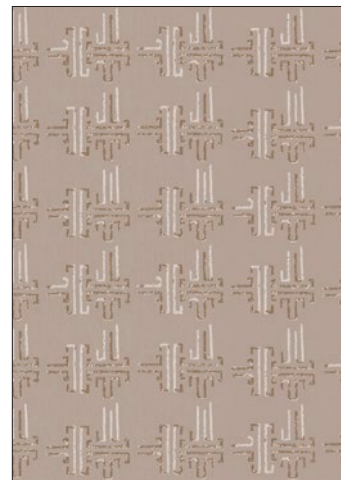
GINKGO COORDINATO 5 COLORWAYS (CL WP36413)