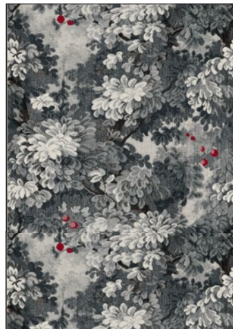
MARLY - FABRIC 4 COLORWAYS (CL 26420) ONE NEW COLORWAY