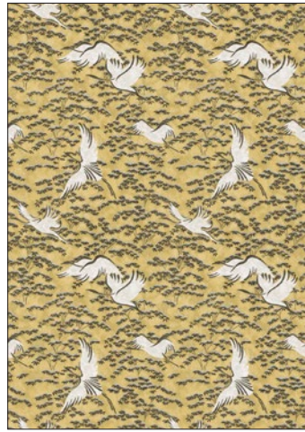
GRU 5 COLORWAYS (CL WP36396)