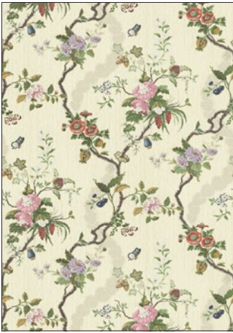
APRILE 4 COLORWAYS (CL WP26728)