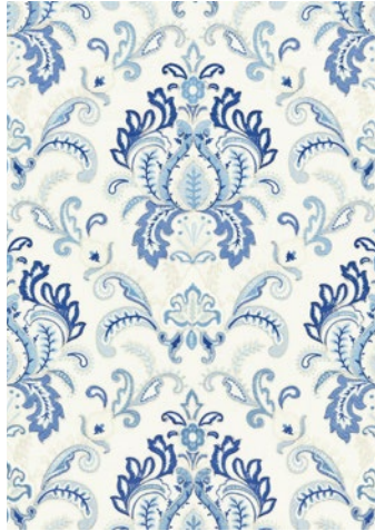
AVA DAMASK EMBROIDERY 2 COLORWAYS (SC 27164)