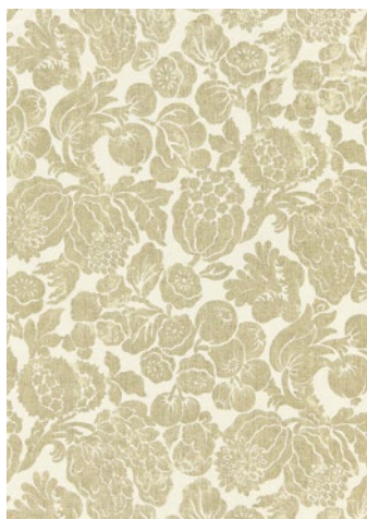
ELSA LINEN PRINT 2 COLORWAYS (SC 16606)