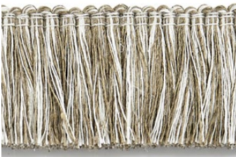
NORA LINEN BRUSH FRINGE 3 COLORWAYS (SC FC1496)