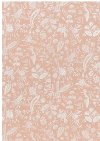
TULIA LINEN PRINT 4 COLORWAYS (SC 16605)