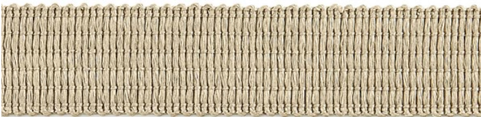
KALLE LINEN TAPE 2 COLORWAYS (SC T3318)