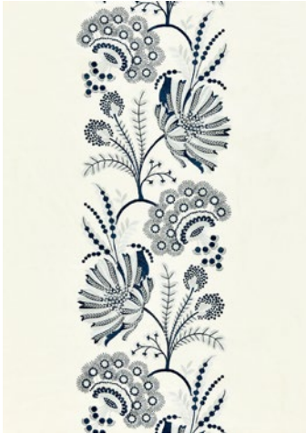
ANNELISE EMBROIDERY 3 COLORWAYS (SC 27162)