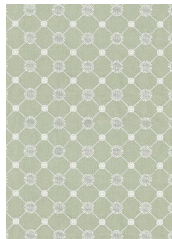
GUSTAVIAN DIAMOND 4 COLORWAYS (SC 27161)