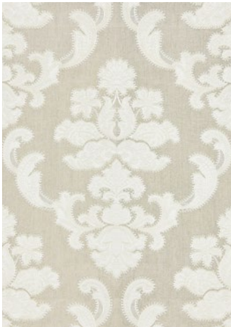
CORNELIA DAMASK EMBROIDERY 3 COLORWAYS (SC 27160)