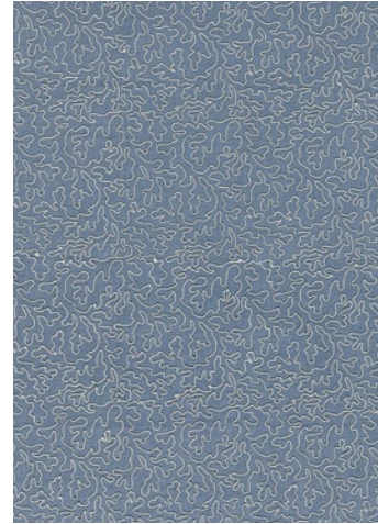
CORAILLE 4 COLORWAYS (SC 27163)