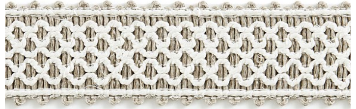
ANSA LINEN BRAID 3 COLORWAYS (SC V1245)