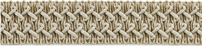
KAARINA LINEN BRAID 2 COLORWAYS (SC V1244)