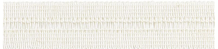
KATJA LINEN TAPE 2 COLORWAYS (SC T3315)