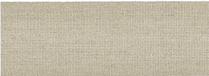
OSLO LINEN TAPE 2 COLORWAYS (SC T3314)