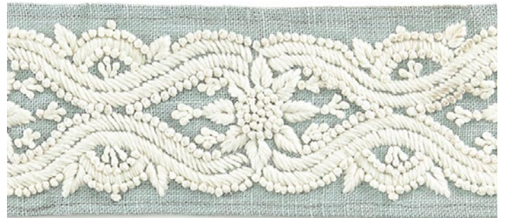
LINNEA EMBROIDERED TAPE 3 COLORWAYS (SC T3298)