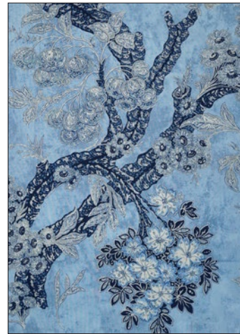
SUMMERHOUSE HILL 3 COLORWAYS (M7 SUMM)