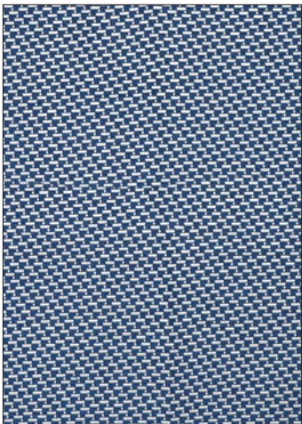
NORTH DOWNS 8 COLORWAYS (EY 13ND)