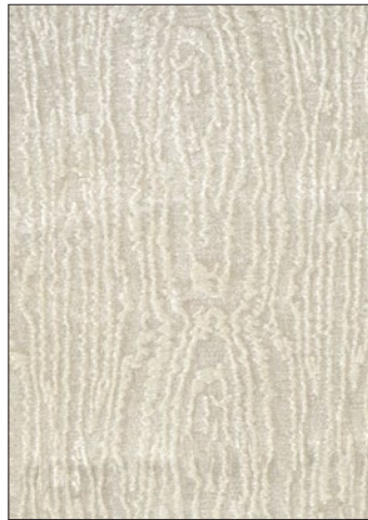
WHITBY 5 COLORWAYS (N3 5102)