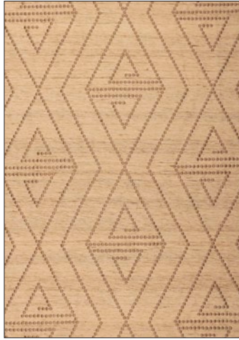
TORQUAY COAST 2 COLORWAYS (ZS 6873)