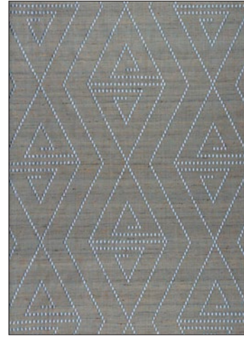
TORQUAY 4 COLORWAYS (ZS 8068)