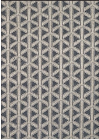
CROSS CHANNEL 8 COLORWAYS (NK CROS)