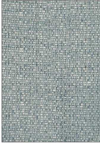
FLINT 10 COLORWAYS (IO 109D)