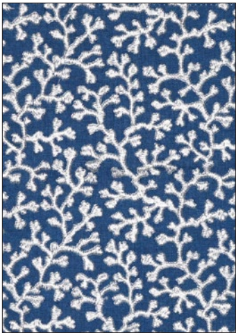
HELE BAY 5 COLORWAYS (ZS 6949)