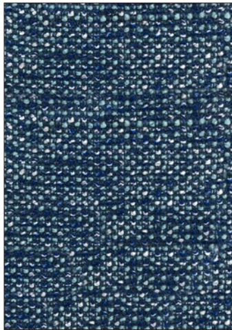
TORRS 7 COLORWAYS (R7 0588)