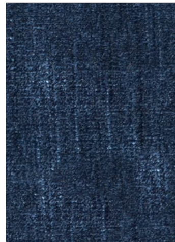
SUPREME VELVET 30 COLORWAYS (VP SUPR)