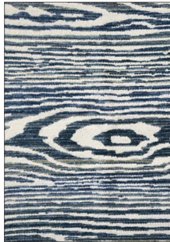
MUIR WOODS 7 COLORWAYS (CD OB41)