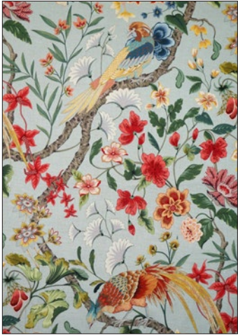
BOTANY BAY 2 COLORWAYS (JP 1340)