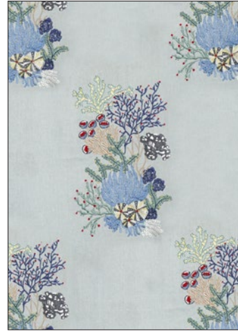
COMBE MARTIN 2 COLORWAYS (JM 7072)