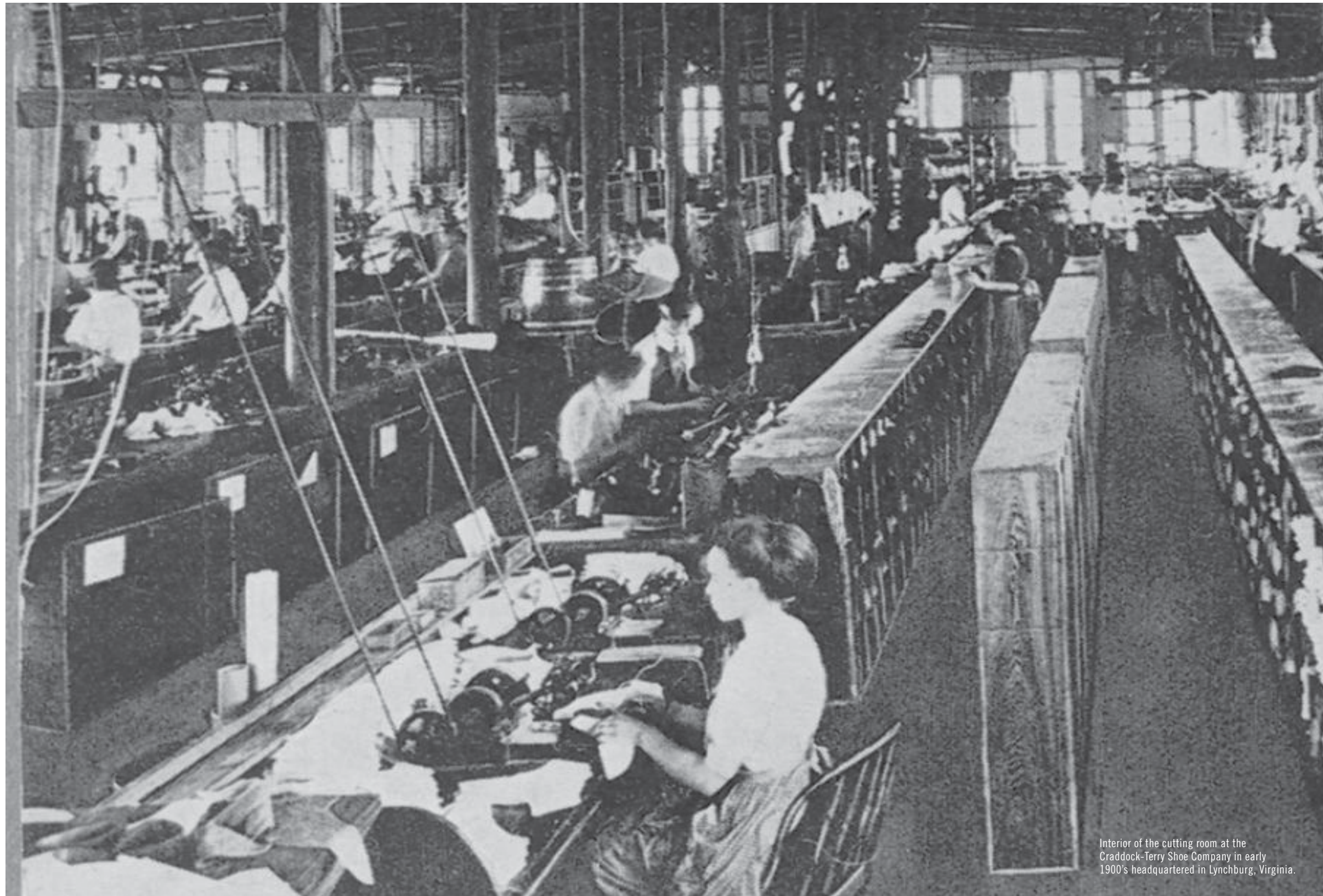
Interior of the cutting room at the Craddock-Terry Shoe Company in early 1900's headquartered in Lynchburg, Virginia.