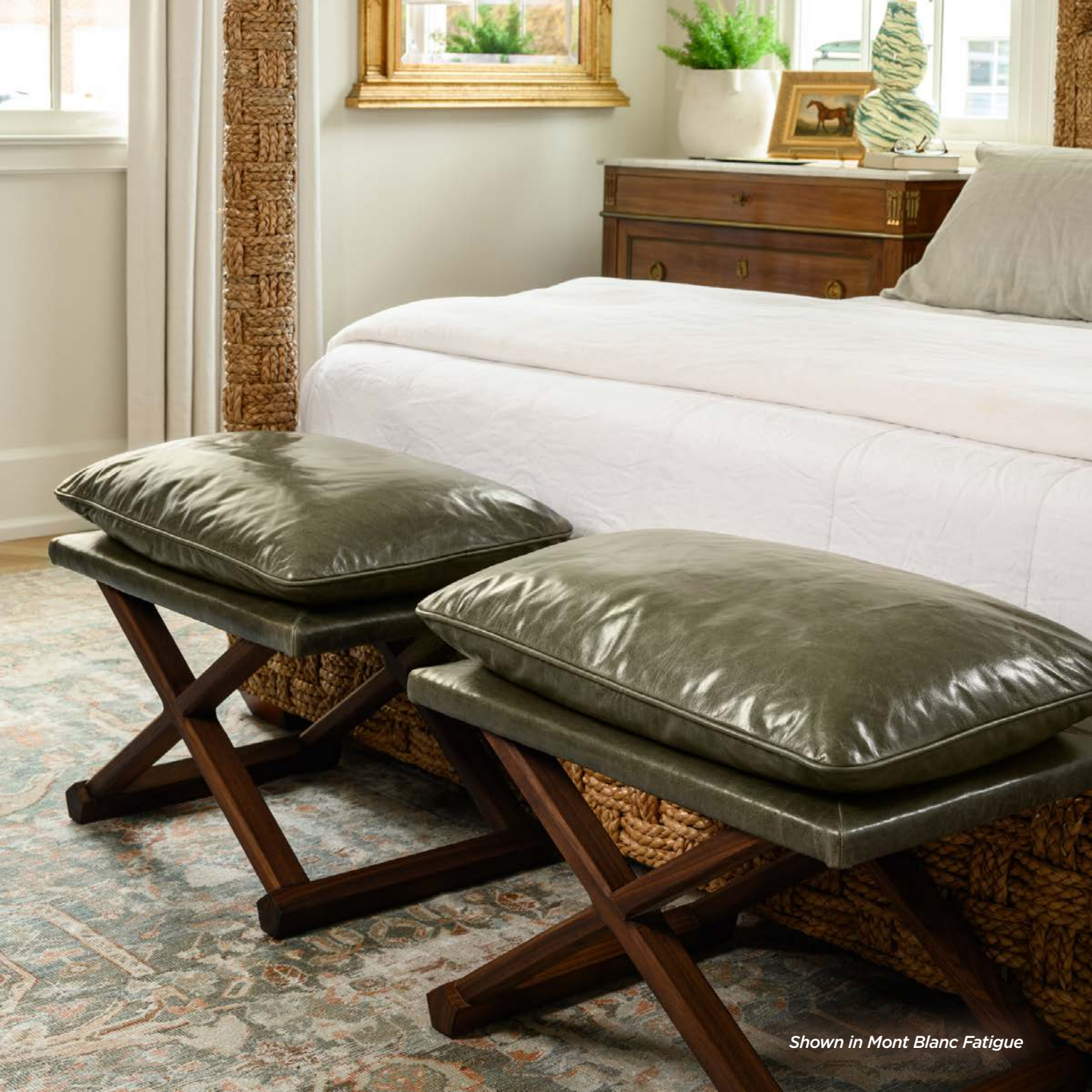
Shown in Mont Blanc Fatigue