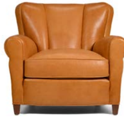
IRVINGTON CLUB CHAIR 31.5"H x 35"W x 35"D

Trade pricing available. For a current list of leather selections, please visit mooreandgiles.com