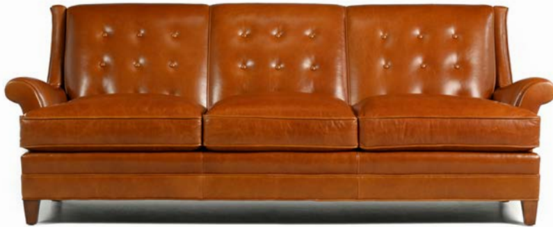
JEFFERSON STREET SOFA 32"H x 84"W x 37"D

Cushions: The ultra-down seat cushions consist of a 2.3 density ultra-cell foam core encased in a sewn cotton/polyester blend cover that contains a down, feather, and fiber mixture. The ratio for the mix is 50% fiber and 50% down and feathers. The 50% down and feather mix is 25% down and 75% feathers. All foam for seats, backs, and internal parts do not contain added flame retardants. All foams are CAL-117-2013 compliant and do not contain PBDE's or formaldehyde.