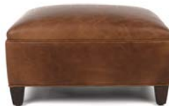
TRAYNHAM OTTOMAN 12.5"H x 23"L (Front) x 21"L (Back) x 16.5"W