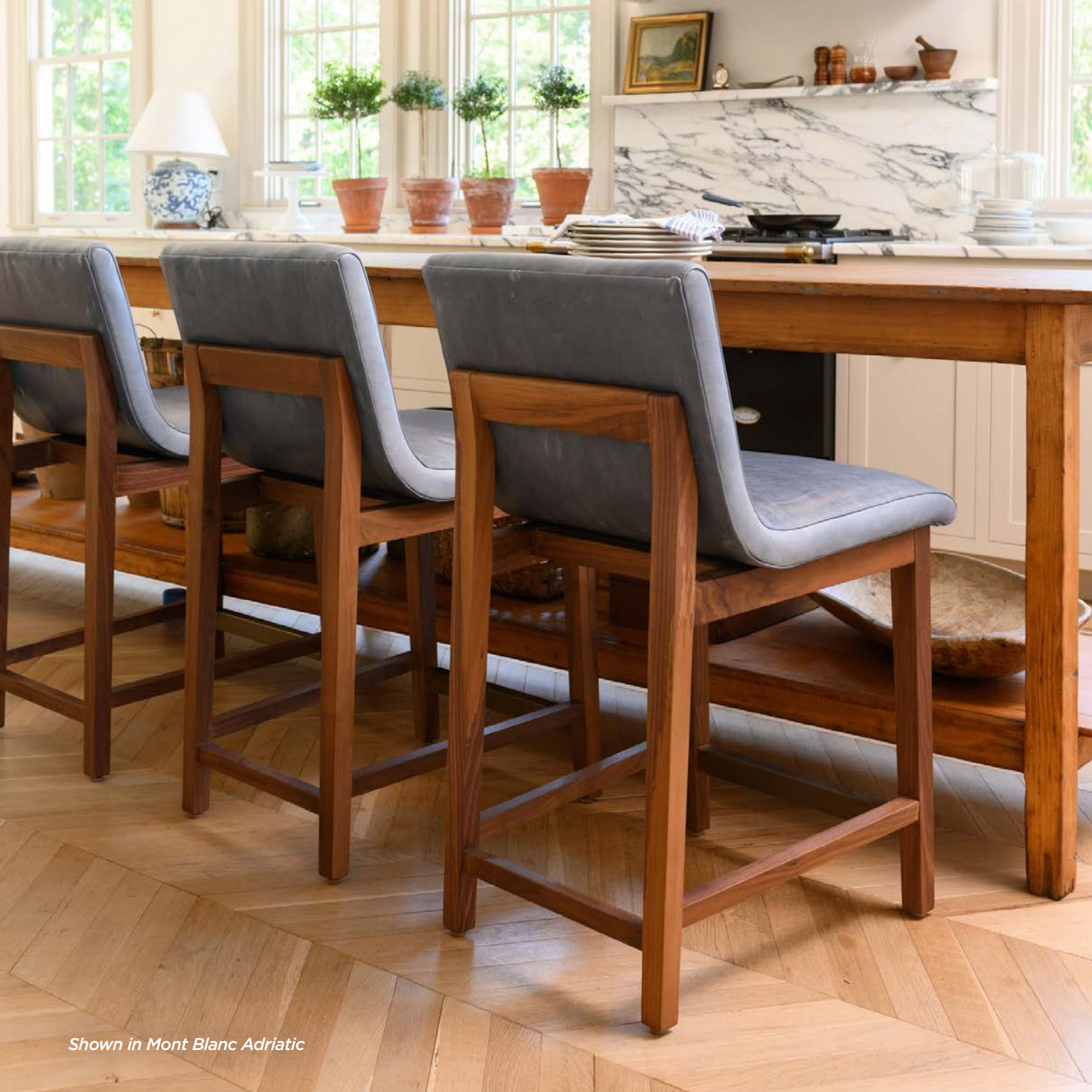
Shown in Mont Blanc Adriatic