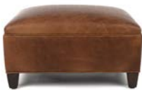
TRAYNHAM OTTOMAN 12.5"H x 23"L (Front) x 21"L (Back) x 16.5"W