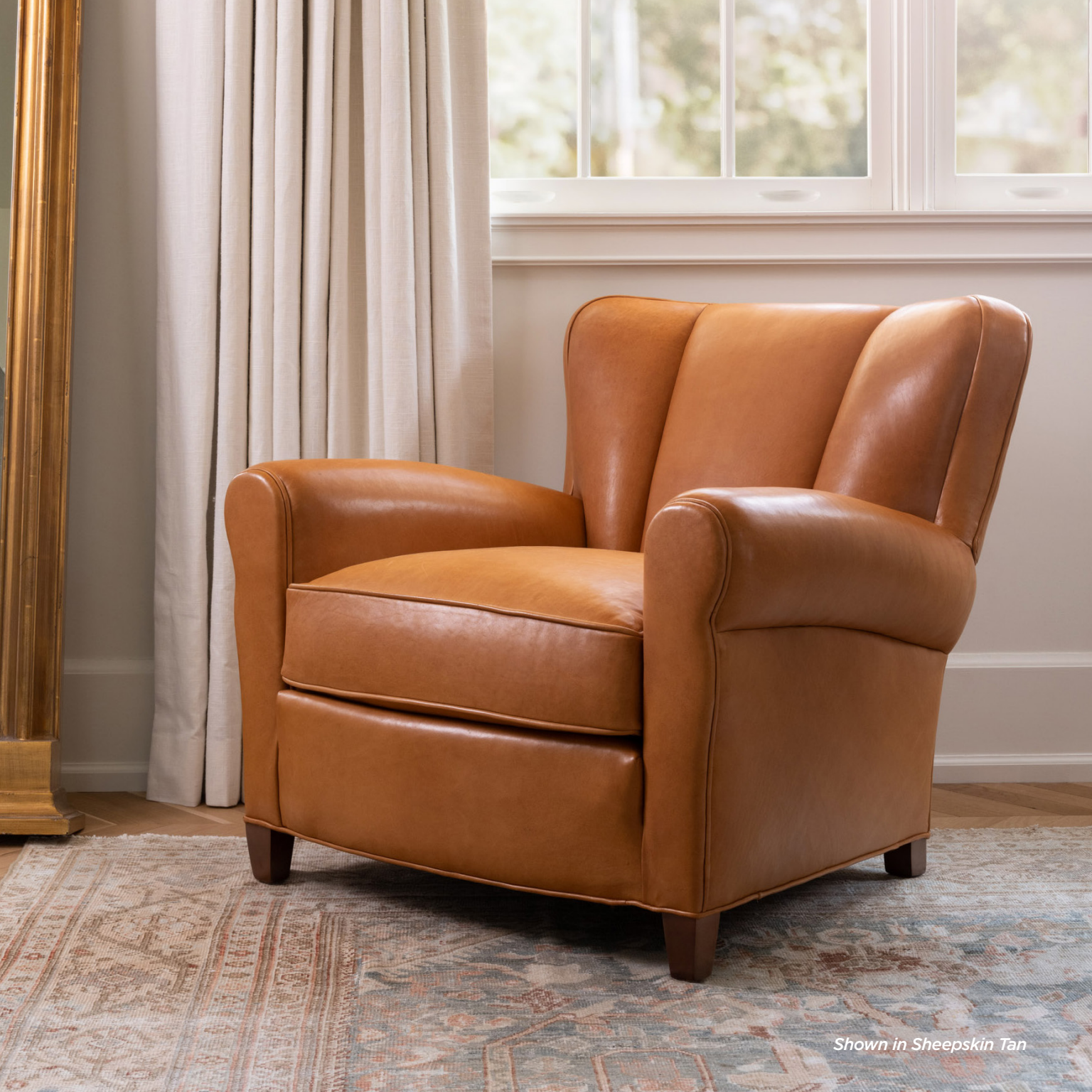
Shown in Sheepskin Tan