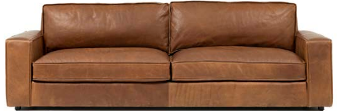
MERIWETHER SOFA 32"H x 112"W x 42"D Available in three lengths: 87", 99", 112"