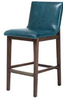
DAHLIA BAR STOOL 43"H x 19"W x 22"D