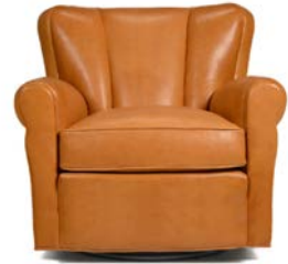
IRVINGTON SWIVEL CHAIR 31.5"H x 35"W x 35"D