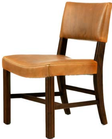
SPENCER DINING CHAIR 34.5"H x 21.5"W x 20.5"D

Cushions: The frame is comprised of layered hardwoods internally and solid walnut on the exterior. The cushion has a 2.5" supportive foam core topped with a 1" soft batting for added comfort and to create a gently crowned seat. CAL-117-2013 compliant..