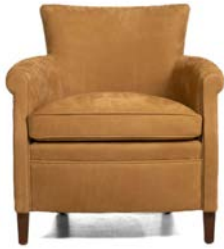
33 CHAIR 28.5"H x 26.5"W x 29.5"D