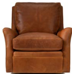
HAMILTON SWIVEL CHAIR 34"H x 35"W x 41"D