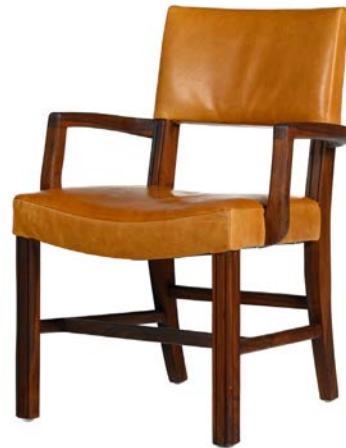
SPENCER DINING ARMCHAIR 34.5"H x 21.5"W x 20.5"D