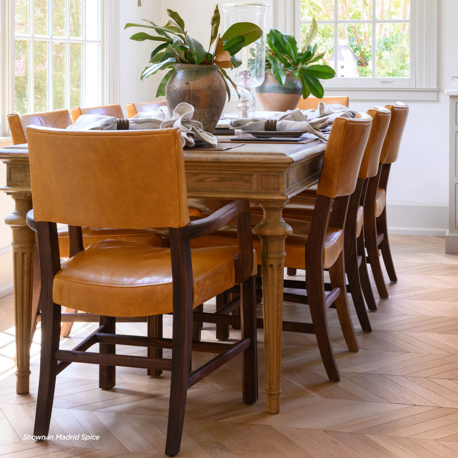
Shown in Madrid Spice