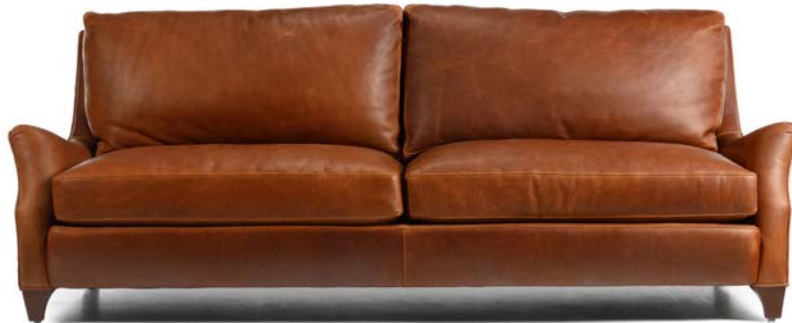
HAMILTON SOFA 33"H x 92"W x 27"D Available in three lengths: 80", 92", 104"