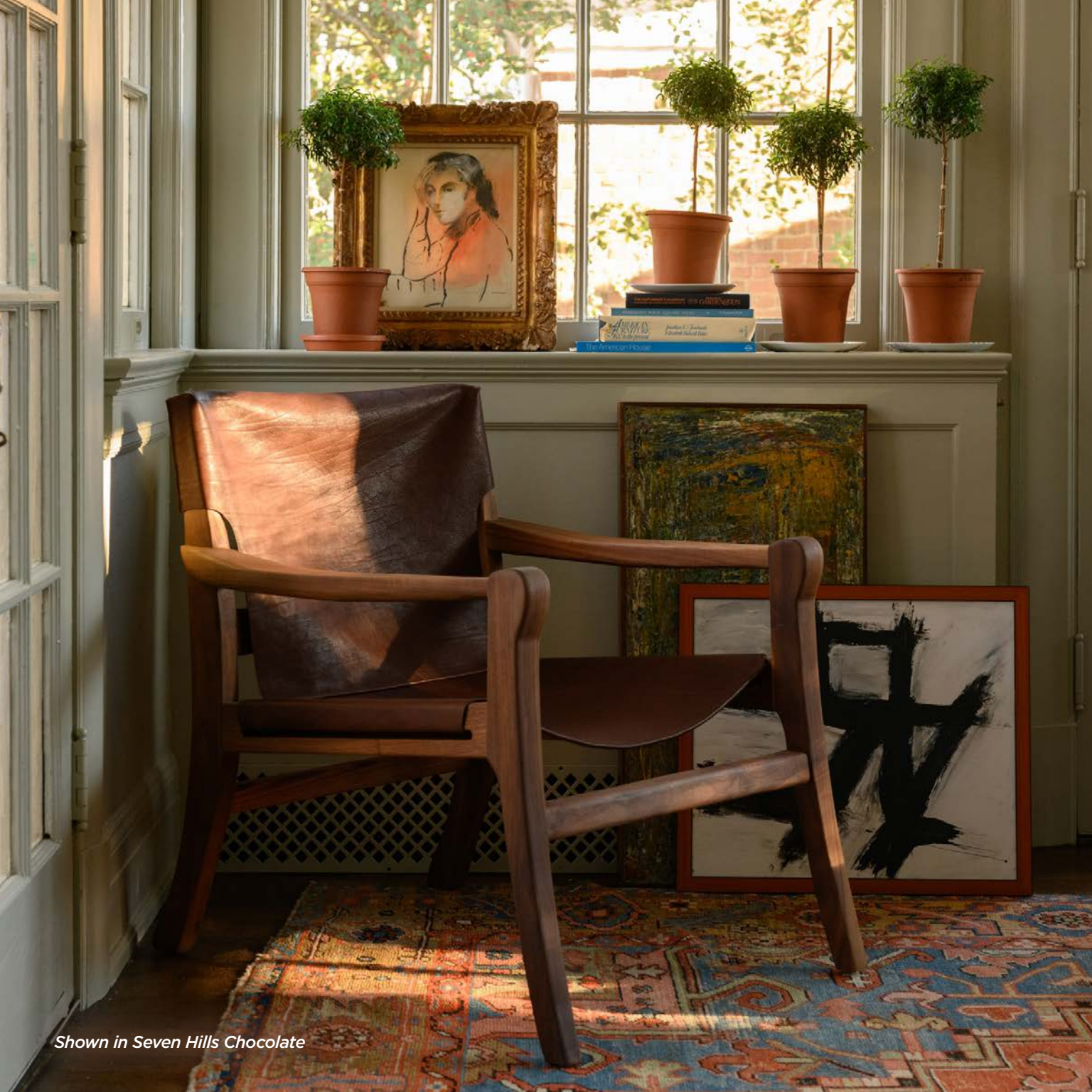
Shown in Seven Hills Chocolate