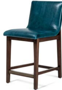
DAHLIA COUNTER STOOL 38"H x 19"W x 22"D