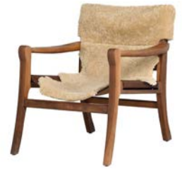
SHEARLING CHAIR CAP Overall length varies by piece Small: 25"W x 4"D