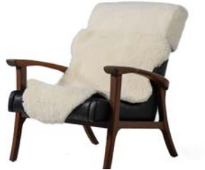
SHEARLING CHAIR CAP Overall length varies by piece Large: 25"W x 6"D