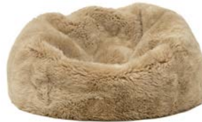
SHEARLING LOUNGER 42"W x 18"H x 42"D