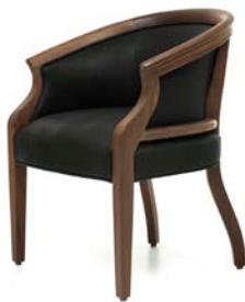
WOODLAND BARREL CHAIR 32"H x 25.25"W x 23"D