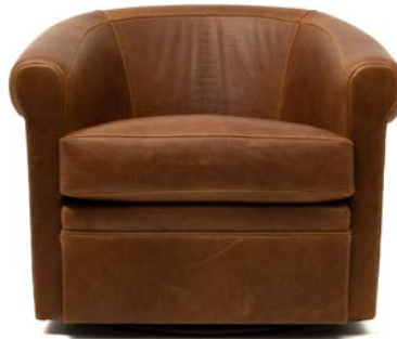
GARLAND SWIVEL CHAIR 29.5"H x 36"W x 34"D

Base Info: Hidden steel base with ball-bearing mechanism allows for a 360° swivel