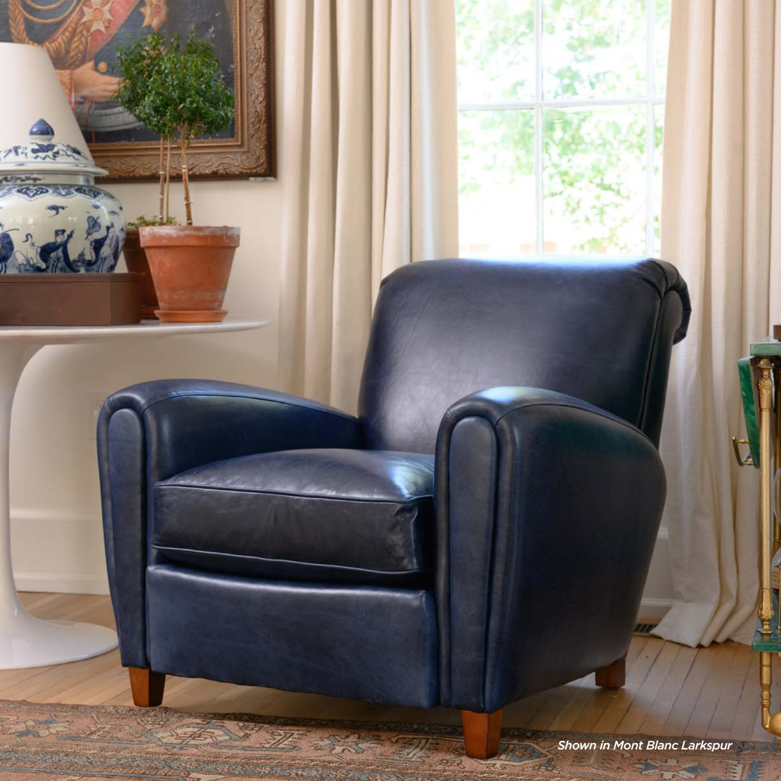
Shown in Mont Blanc Larkspur