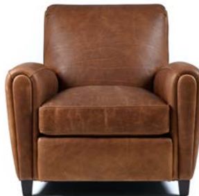
TRAYNHAM CLUB CHAIR 32"H x 34"W x 30"D