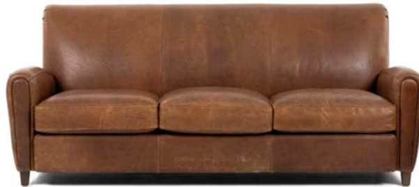
TRAYNHAM SOFA 33"H x 82"W x 28"D