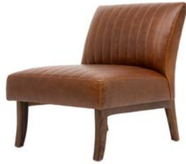
KEMPER CHANNELED SLIPPER CHAIR 30.5"H x 28.5"W x 31"D