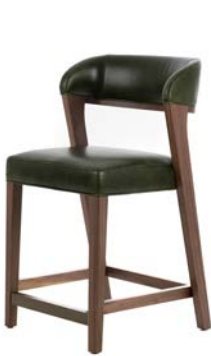
ISABELLA COUNTER STOOL 39.5"H x 20.5"W x 21"D