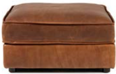
MERIWETHER OTTOMAN 15.5"H x 32"W x 29" D