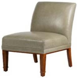
GRACE SLIPPER CHAIR 29.5"H x 23"W x 25"D