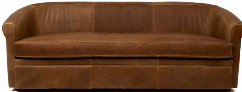
GARLAND SOFA 31"H x 83"W x 35"D