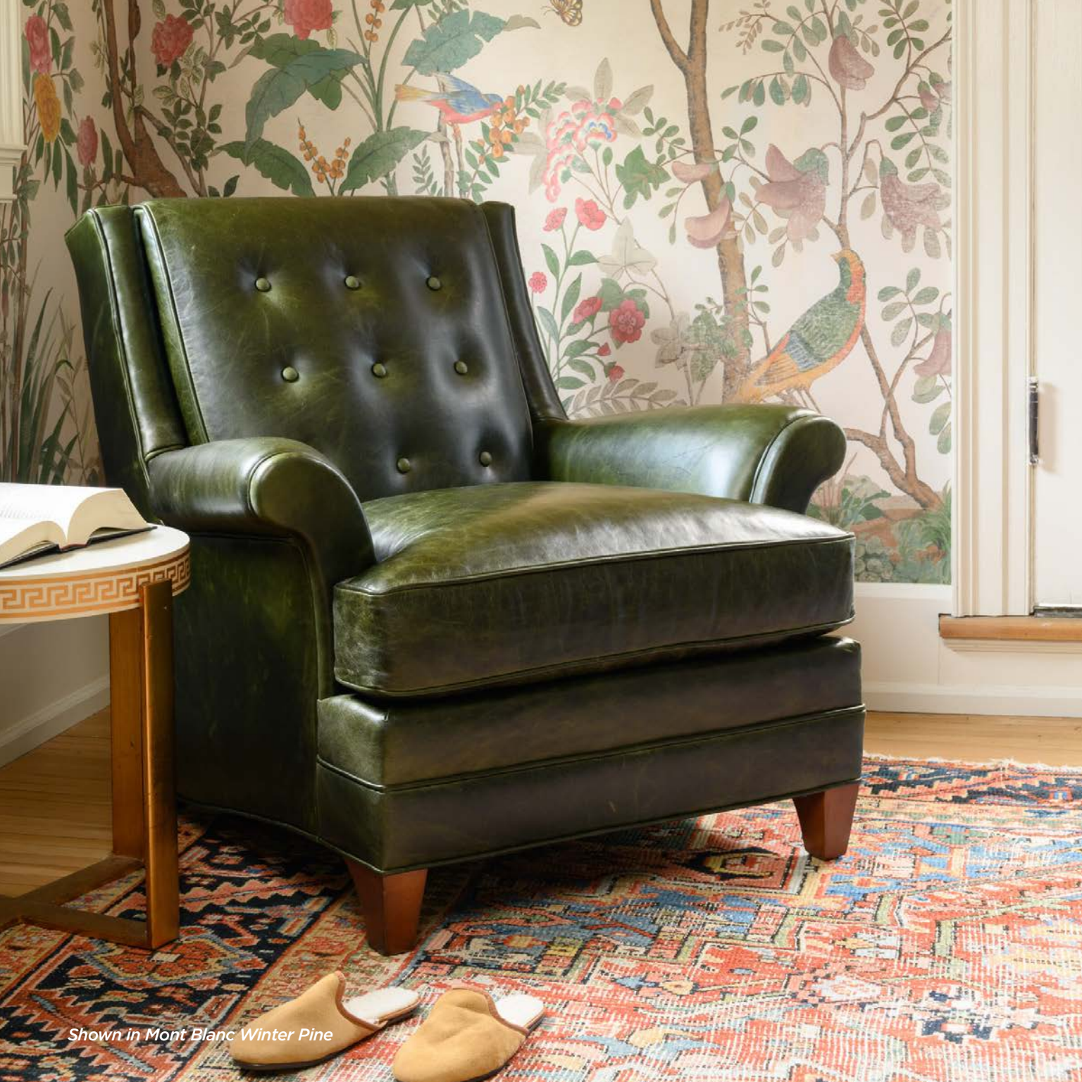
Shown In Mont Blanc Winter Pine