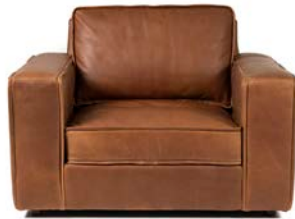
MERIWETHER ARMCHAIR 32"H x 50"W x 43"D