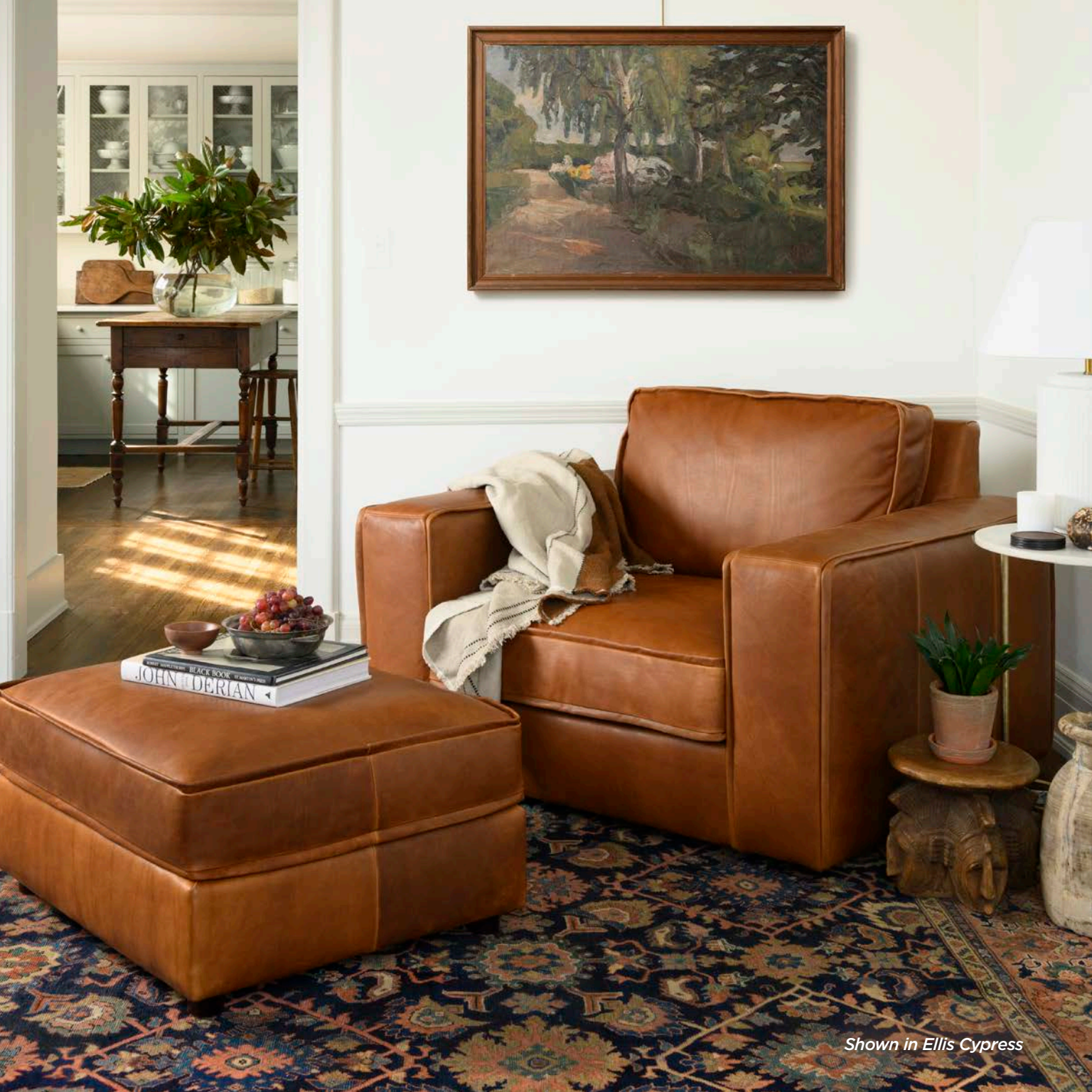
Shown in Ellis Cypress