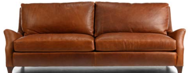
HAMILTON SOFA 33"H x 92"W x 27"D Available in three lengths: 80", 92", 104"