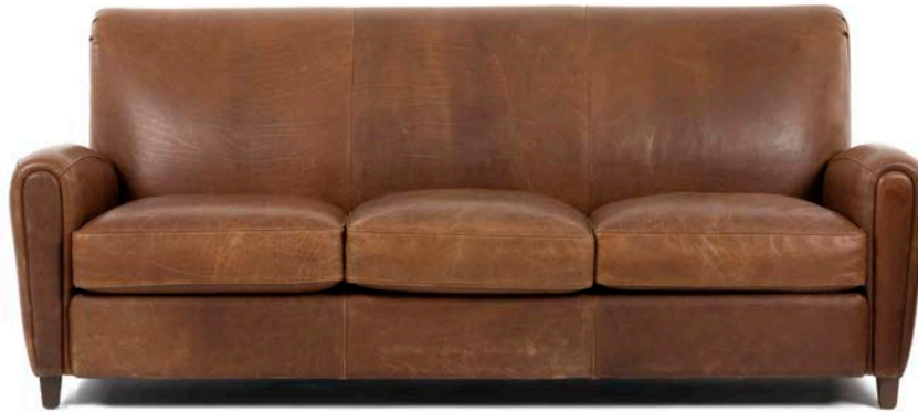
TRAYNHAM SOFA 33"H x 82"W x 28"D

Cushions: The ultra-down seat cushions consist of a 2.3 density ultra-cell foam core encased in a sewn cotton/polyester blend cover that contains a down, feather, and fiber mixture. The ratio for the mix is 50% fiber and 50% down and feathers. The 50% down and feather mix is 25% down and 75% feathers. All foam for seats, backs, and internal parts do not contain added flame retardants. All foams are CAL-117-2013 compliant and do not contain PBDE's or formaldehyde.