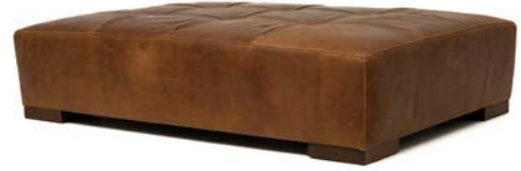
RANDOLPH OTTOMAN 13"H x 41"W x 58.5"L