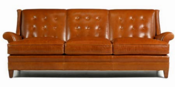
JEFFERSON STREET SOFA 32"H x 84"W x 37"D