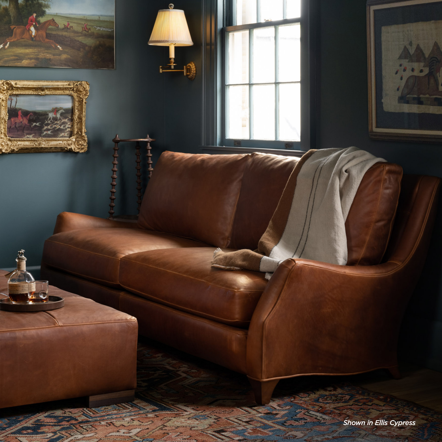
Shown in Ellis Cypress