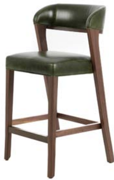
ISABELLA BAR STOOL 44.5"H x 20.5"W x 21"D