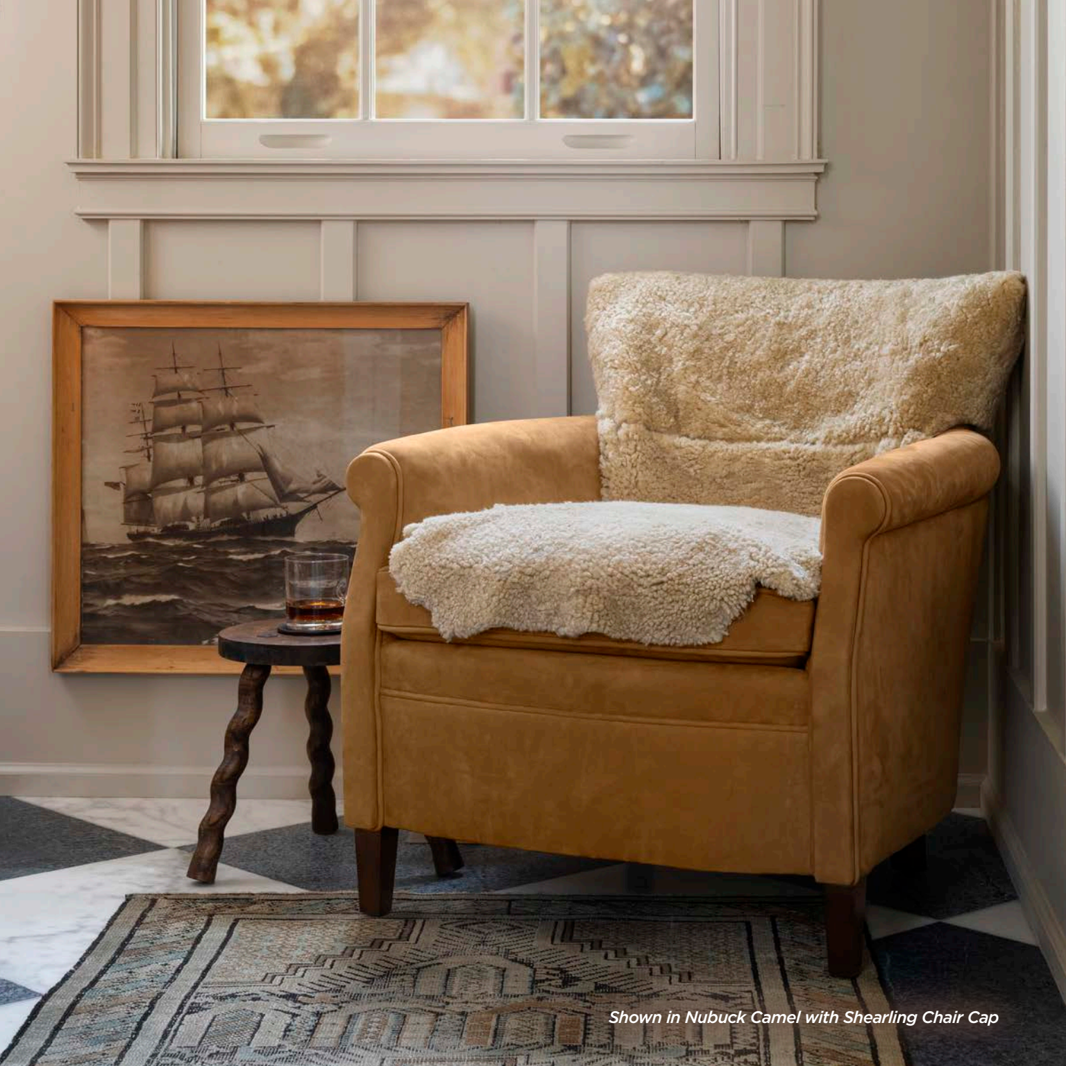
Shown in Nubuck Camel with Shearling Chair Cap