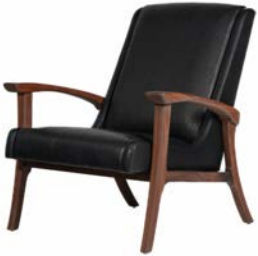
PERCIVAL SIDE CHAIR 34.75"H x 30.25"W x 34"D