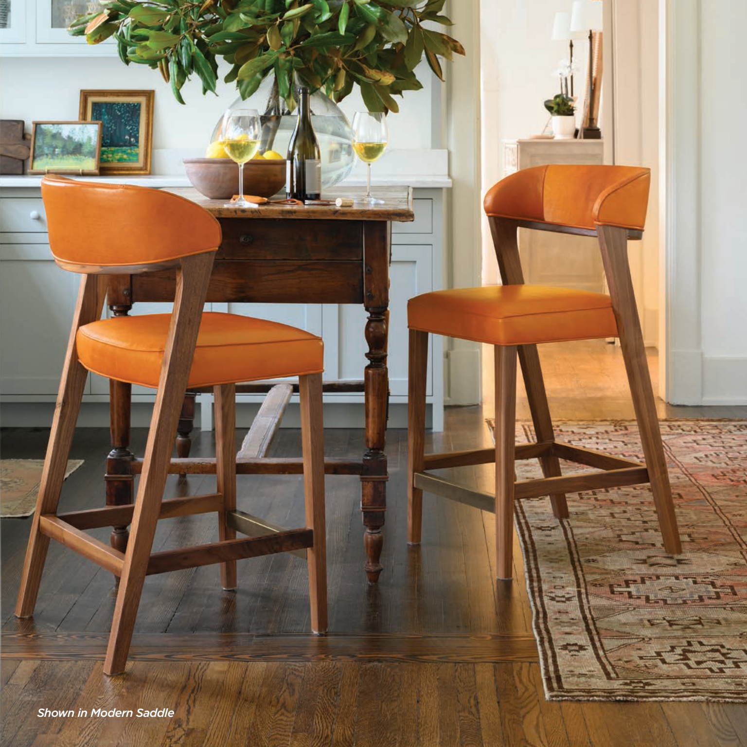
Shown in Modern Saddle