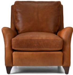
HAMILTON LOUNGE CHAIR 34"H x 35"W x 41"D

Cushions: The ultra-down seat cushions consist of a 2.3 density ultra-cell foam core encased in a sewn cotton/polyester blend cover that contains a down, feather, and fiber mixture. The ratio for the mix is 50% fiber and 50% down and feathers. The 50% down and feather mix is 25% down and 75% feathers. All foam for seats, backs, and internal parts do not contain added flame retardants. All foams are CAL-117-2013 compliant and do not contain PBDE's or formaldehyde.