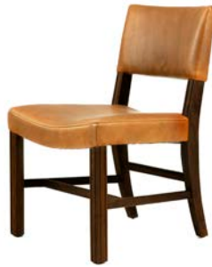
SPENCER DINING CHAIR 34"H x 21.5"W x 20.5"D