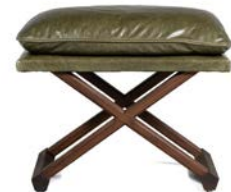
OAKLEY PILLOWTOP BENCH 23.75"H x 24.75"W x 17"D