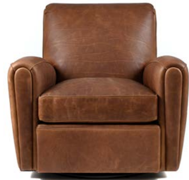
TRAYNHAM SWIVEL CHAIR 32"H X 34"W X 30"D