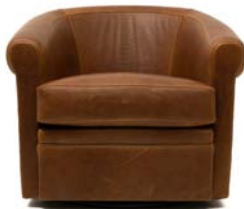
GARLAND SWIVEL CHAIR 29.5"H x 36"W x 34"D