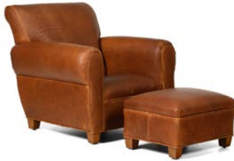
CHILDREN'S CLUB CHAIR & OTTOMAN SET Chair 24"H X 21"W x 26.5"D Ottoman 10.25"H x 16.5"W x 13"D