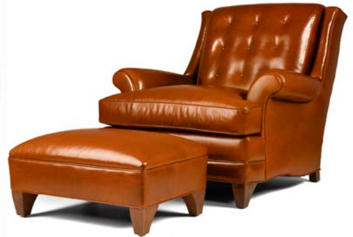
JEFFERSON STREET OTTOMAN 12"H x 23"L (Front) x 21"L (Back) x 16.5"W