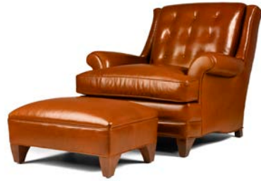
JEFFERSON STREET OTTOMAN 12"H x 23"L (Front) x 21"L (Back) x 16.5"W