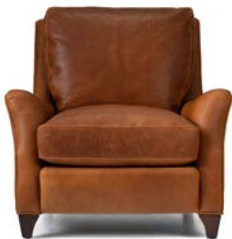
HAMILTON LOUNGE CHAIR 34"H x 35"W x 41"D