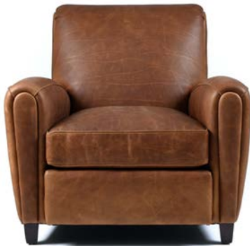
TRAYNHAM CLUB CHAIR 32"H x 34"W x 30"D