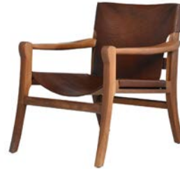
BLACKWATER SLING CHAIR 31.5"H x 29"W x 29"D