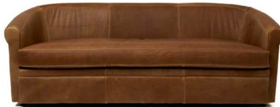
GARLAND SOFA 31"H x 83"W x 35"D