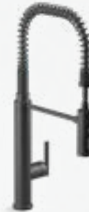
KOHLER CRUE KITCHEN FAUCET MATTE BLACK