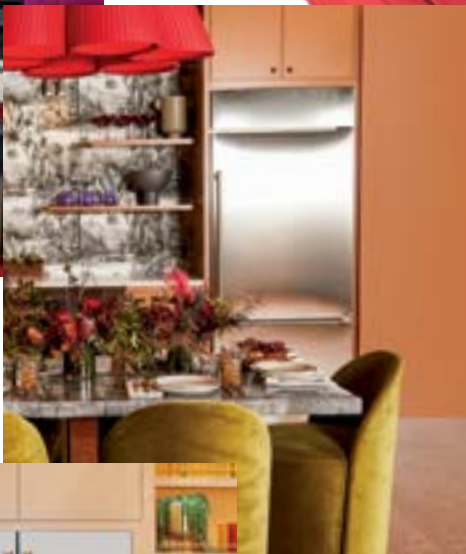
Stainless Steel with Brushed Bronze Hardware