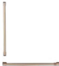
Café Refrigeration Handle Kit