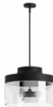
KOHLER Purist® Pendant

A contemporary collection paired with thoughtful technology that adapts to any kitchen design.