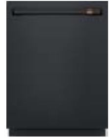
Café Stainless Interior Dishwasher with Ultra Wash & Dual Convection Dry

This Café refrigerator has a Dual-Dispense Autofill Pitcher on the inside. Enjoy chilled, delicious water anytime with a pitcher that automatically refills when placed on its docking station.