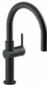
KOHLER Crue® Kitchen Faucet

A contemporary collection paired with thoughtful technology that adapts to any kitchen design.