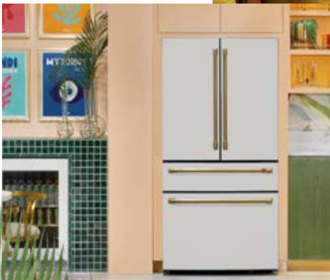
Matte White with Brushed Brass Hardware