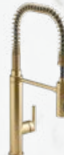
KOHLER TONE KITCHEN FAUCET VIBRANT BRUSHED MODERN BRASS