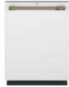
Café Stainless Interior Dishwasher with Ultra Wash & Dual Convection Dry

This Café refrigerator has a Dual-Dispense Autofill Pitcher on the inside. Enjoy chilled, delicious water anytime with a pitcher that automatically refills when placed on its docking station.