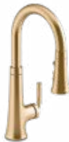
KOHLER Tone® Kitchen Faucet

With clean lines and a soft teardrop base, the warm minimalist style of the Tone kitchen faucet collection makes for a perfect fit in any space.