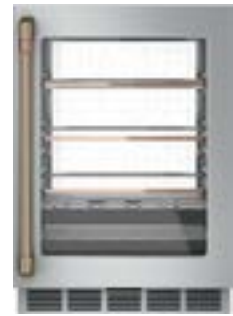
Café™ Beverage Center