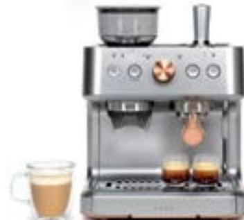
Café™ BELLISSIMO Semi Automatic Espresso Machine + Frother

Simple architectural forms combine with sensual design lines to create an archetype of modern, minimalist style.