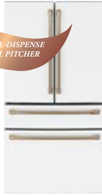
Café 28.7 Cu. Ft. Smart 4-Door French-Door Refrigerator With Dual-Dispense AutoFill Pitcher

This Café refrigerator has a Dual-Dispense Autofill Pitcher on the inside. Enjoy chilled, delicious water anytime with a pitcher that automatically refills when placed on its docking station.