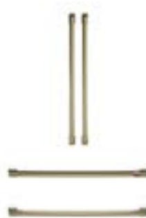
Café Refrigeration Handle Kit