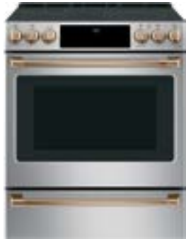
Café™ 30" Smart Slide-In, Front-Control, Radiant and Convection Range