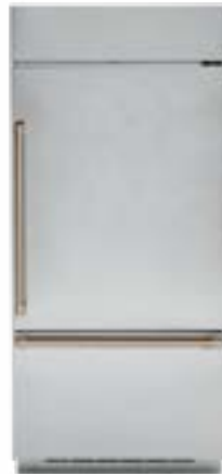
Café™ 21.3 Cu. Ft. Built-In Bottom-Freezer Refrigerator