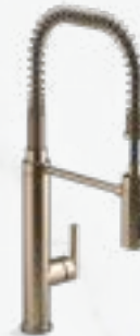
KOHLER VIBRANT KITCHEN FAUCET BRUSHED BRONZE