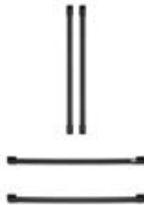
Café Refrigeration Handle Kit