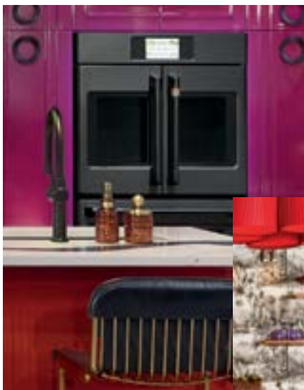
Matte Black with Flat Black Hardware