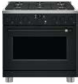
Café 36" Smart Commercial-Style Range with 6 Burners, available in All-Gas and Dual-Fuel models

This Café commercial-style range is inspired by professional kitchens.