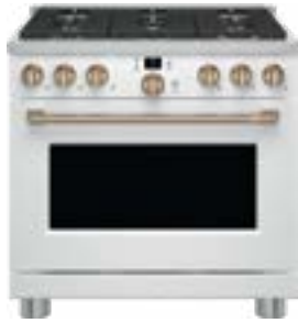
Café 36" Smart Commercial-Style Range with 6 Burners, available in All-Gas and Dual-Fuel models

This Café commercial-style range is inspired by professional kitchens.