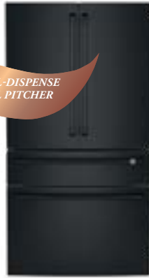
Café 28.7 Cu. Ft. Smart 4-Door French-Door Refrigerator With Dual-Dispense AutoFill Pitcher

This Café refrigerator has a Dual-Dispense Autofill Pitcher on the inside. Enjoy chilled, delicious water anytime with a pitcher that automatically refills when placed on its docking station.